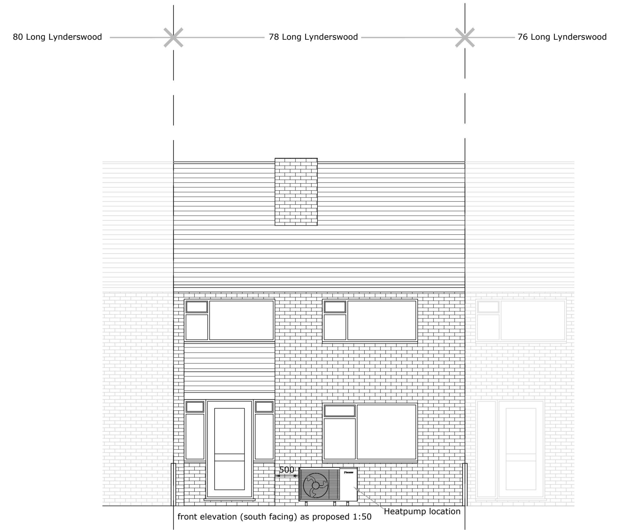
front elevation (south facing) as proposed 1:50