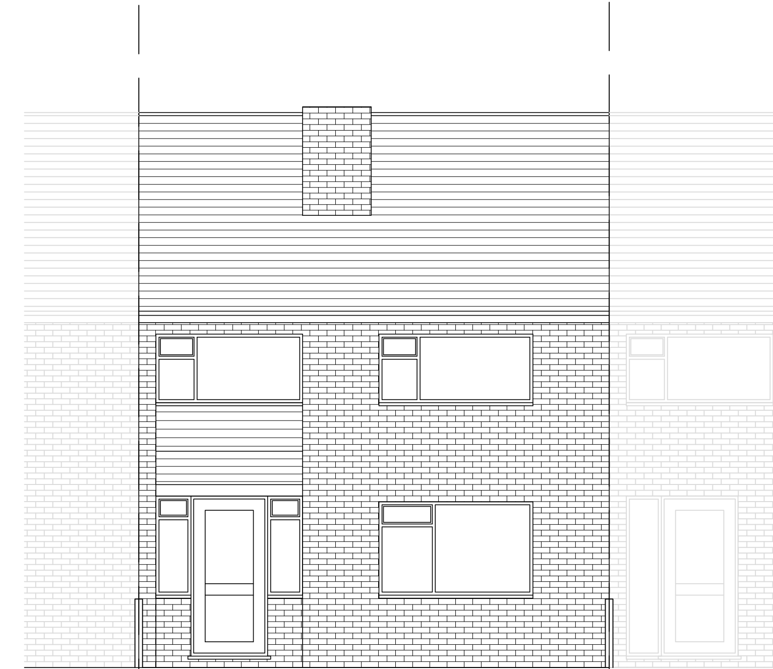
front elevation (south facing) as existing 1:50

80 Long Lynderswood — 78 Long Lynderswood — 76 Long Lynderswood