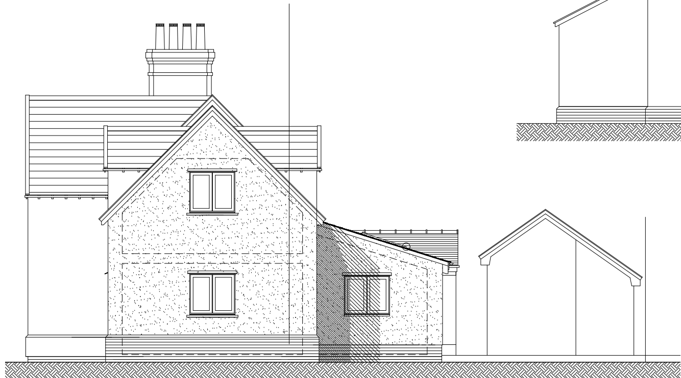
Proposed Side (west) Elevation

Roof finish to single-storey extensions to be Natural Slate with inverted dormers to first floor windows.