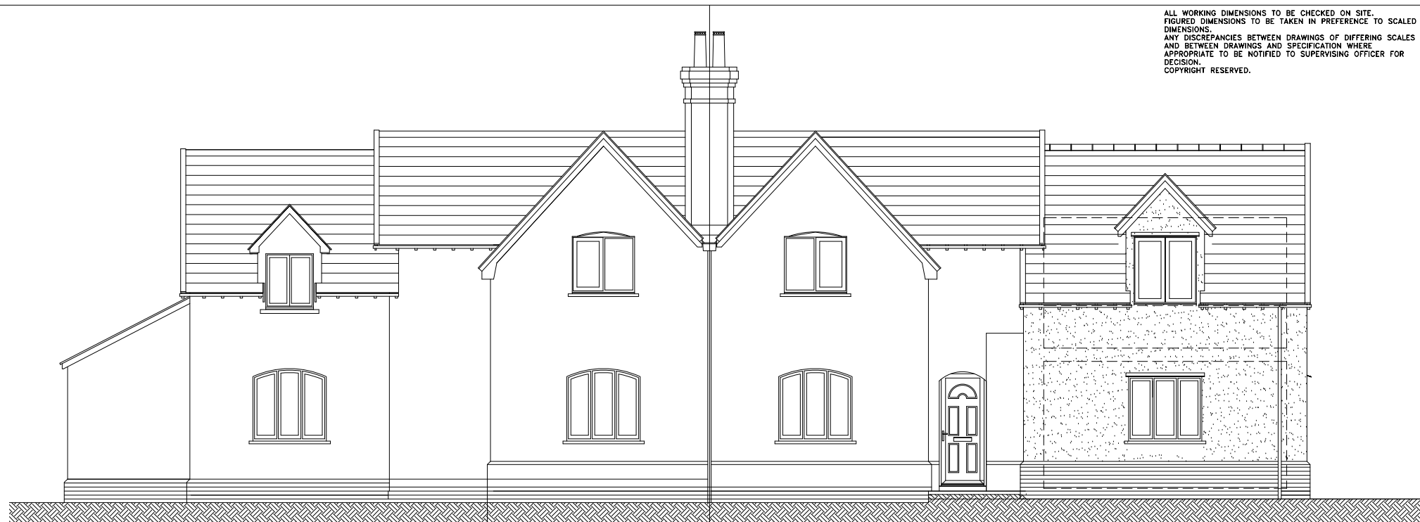
Proposed Front (north) Elevation

ALL WORKING DIMENSIONS TO BE CHECKED ON SITE. FIGURED DIMENSIONS TO BE TAKEN IN PREFERENCE TO SCALED DIMENSIONS. ANY DISCREPANCIES BETWEEN DRAWINGS OF DIFFERING SCALES AND BETWEEN DRAWINGS AND SPECIFICATION WHERE APPROPRIATE TO BE NOTIFIED TO SUPERVISING OFFICER FOR DECISION. COPYRIGHT RESERVED.