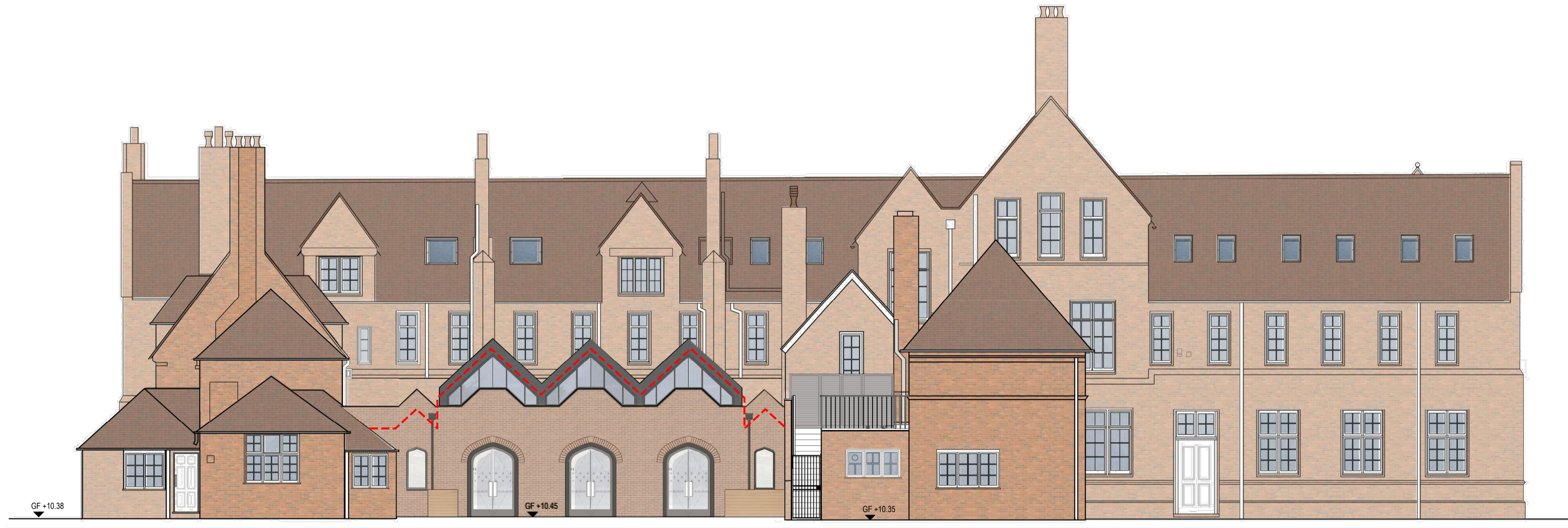
1 Proposed North Elevation Scale 1:100