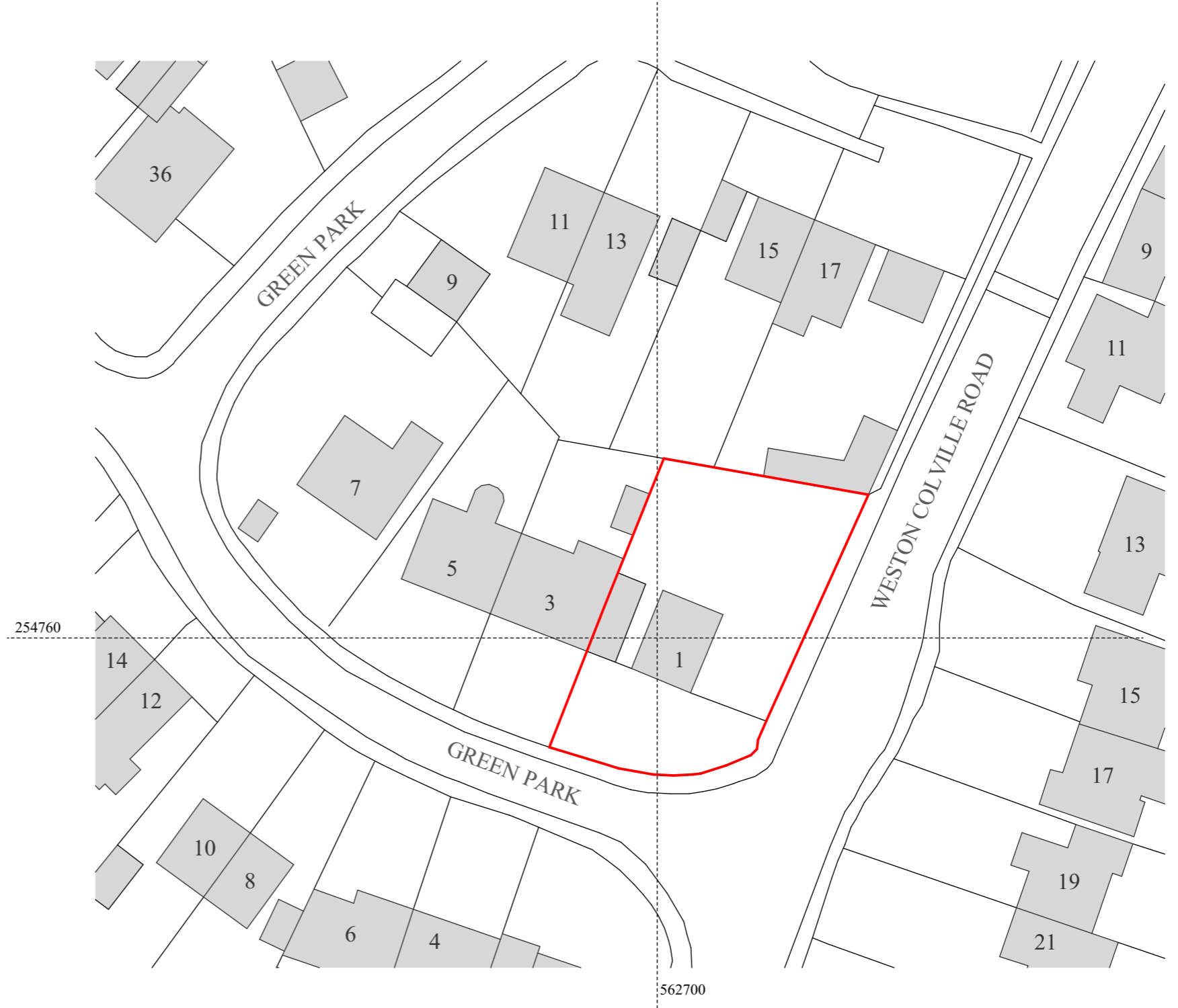
1:500 Block Plan