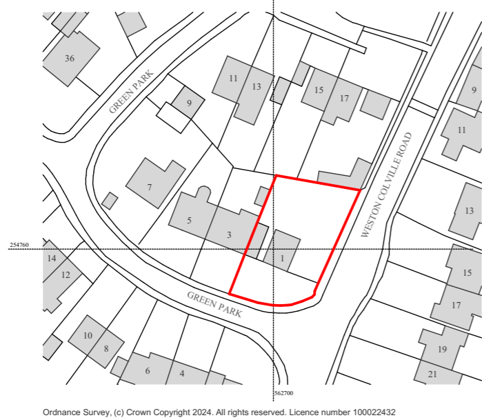
1:1250 Location Plan