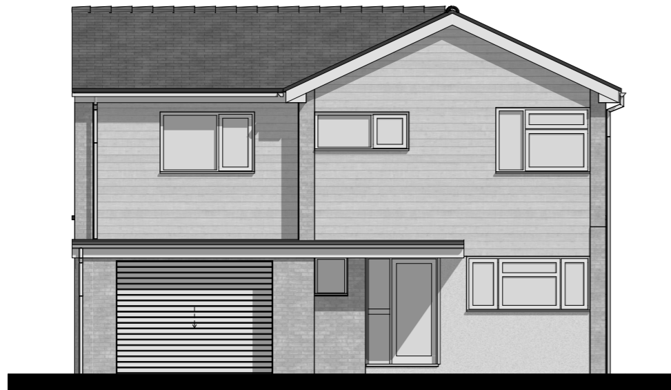
1:100 Proposed South East Elevation