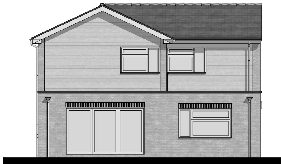
1:100 Proposed North West Elevation