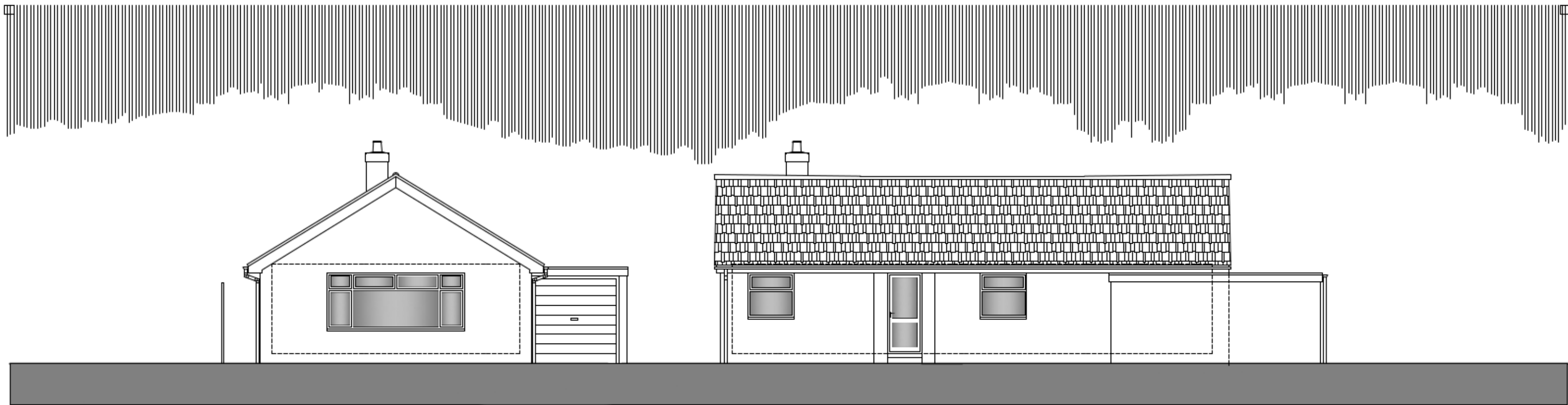
FRONT / NORTH ELEVATION 1:100