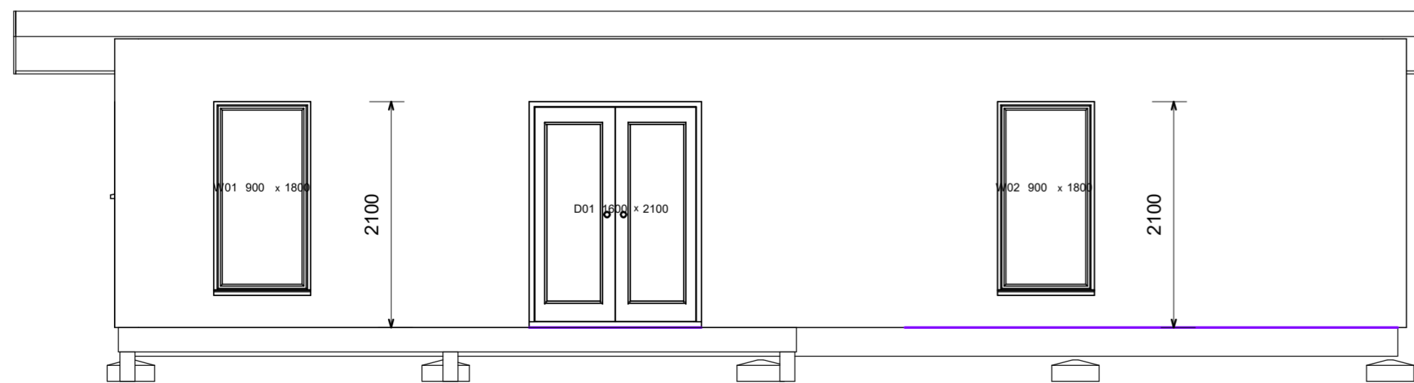
3 South Elevation 1 : 50