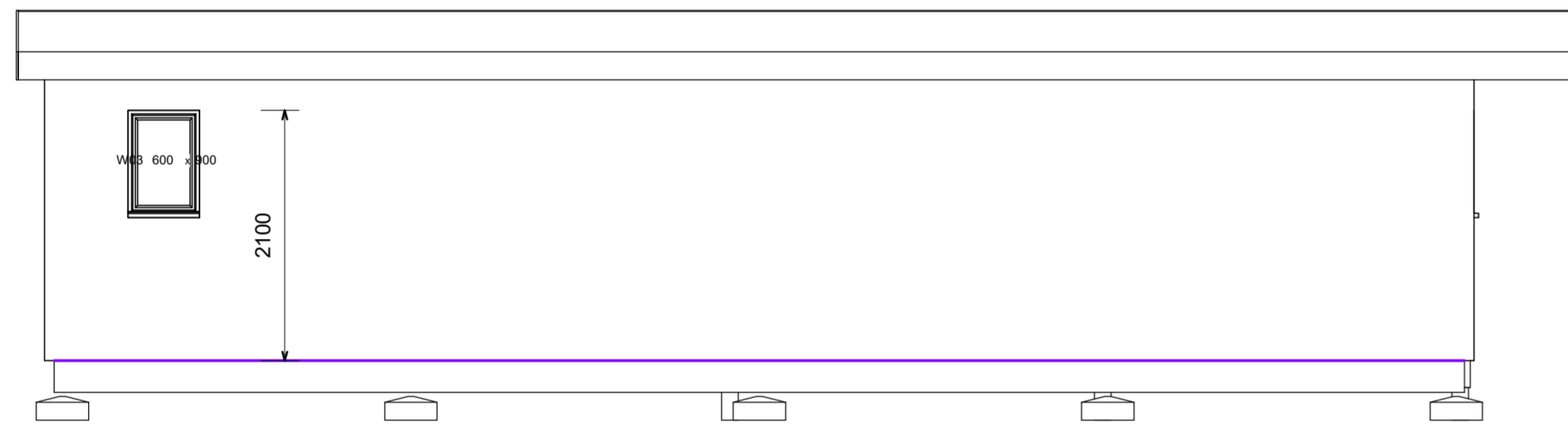
2 North Elevation 1 : 50