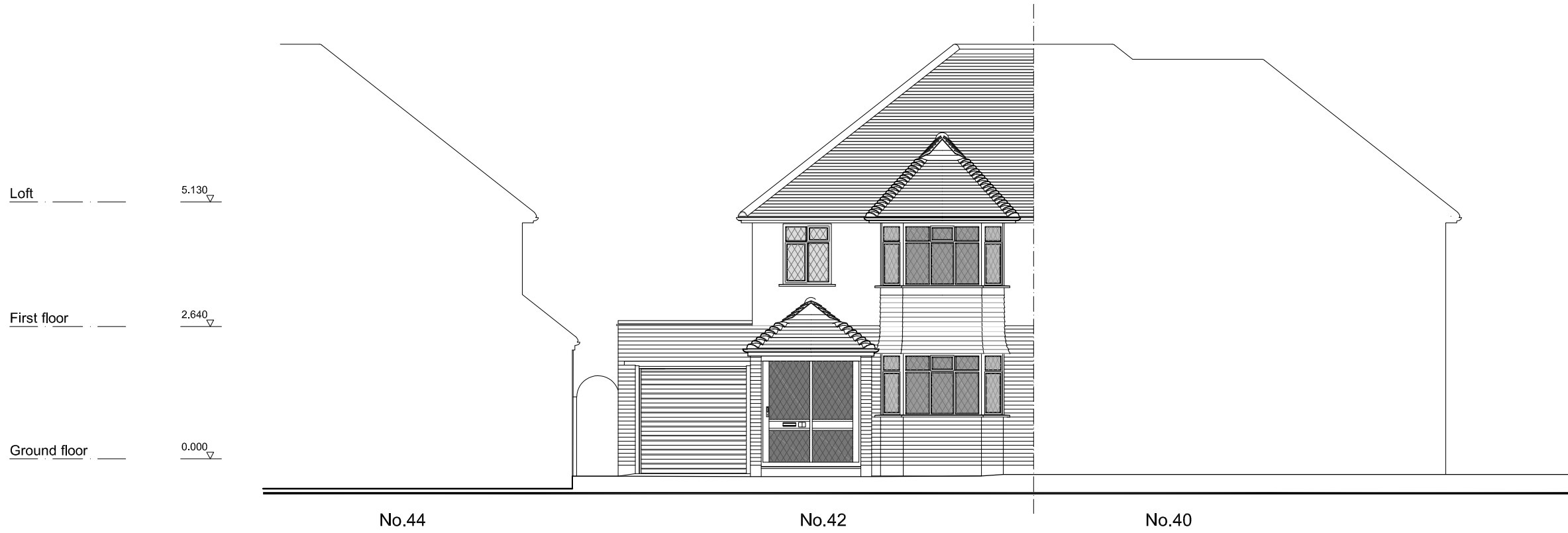
FRONT ELEVATION (North West)