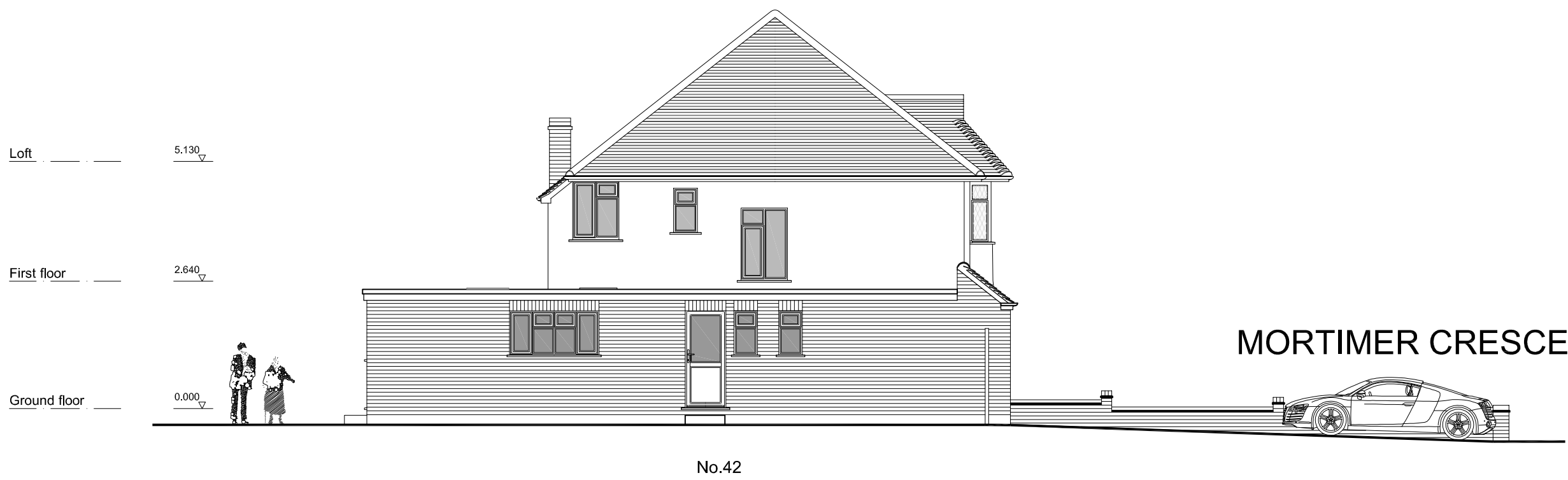
SIDE ELEVATION (North East)