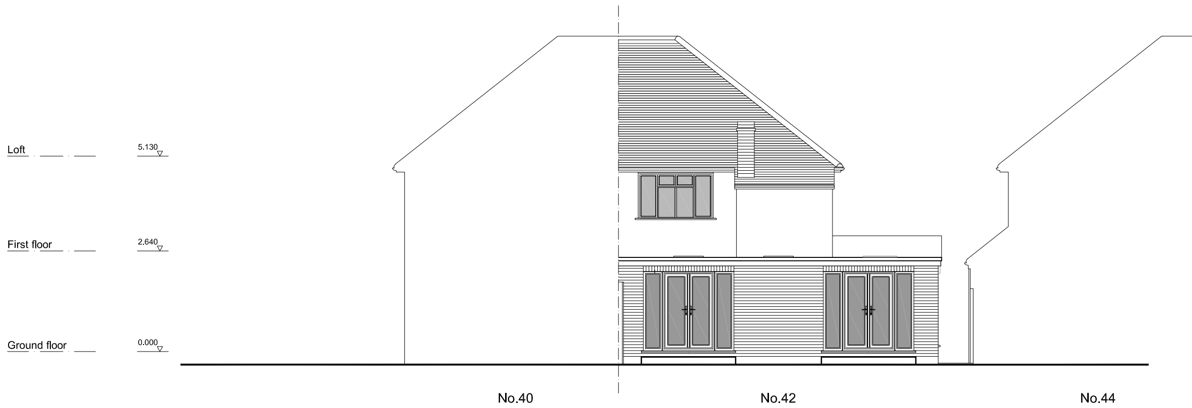
REAR ELEVATION (South East)