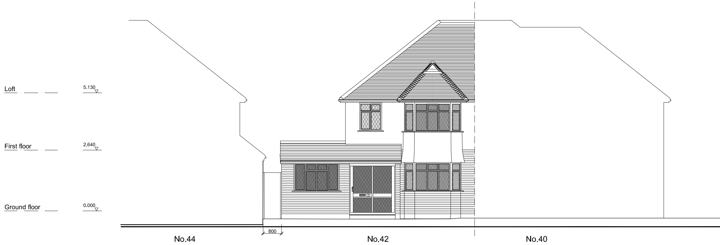
FRONT ELEVATION (North West)