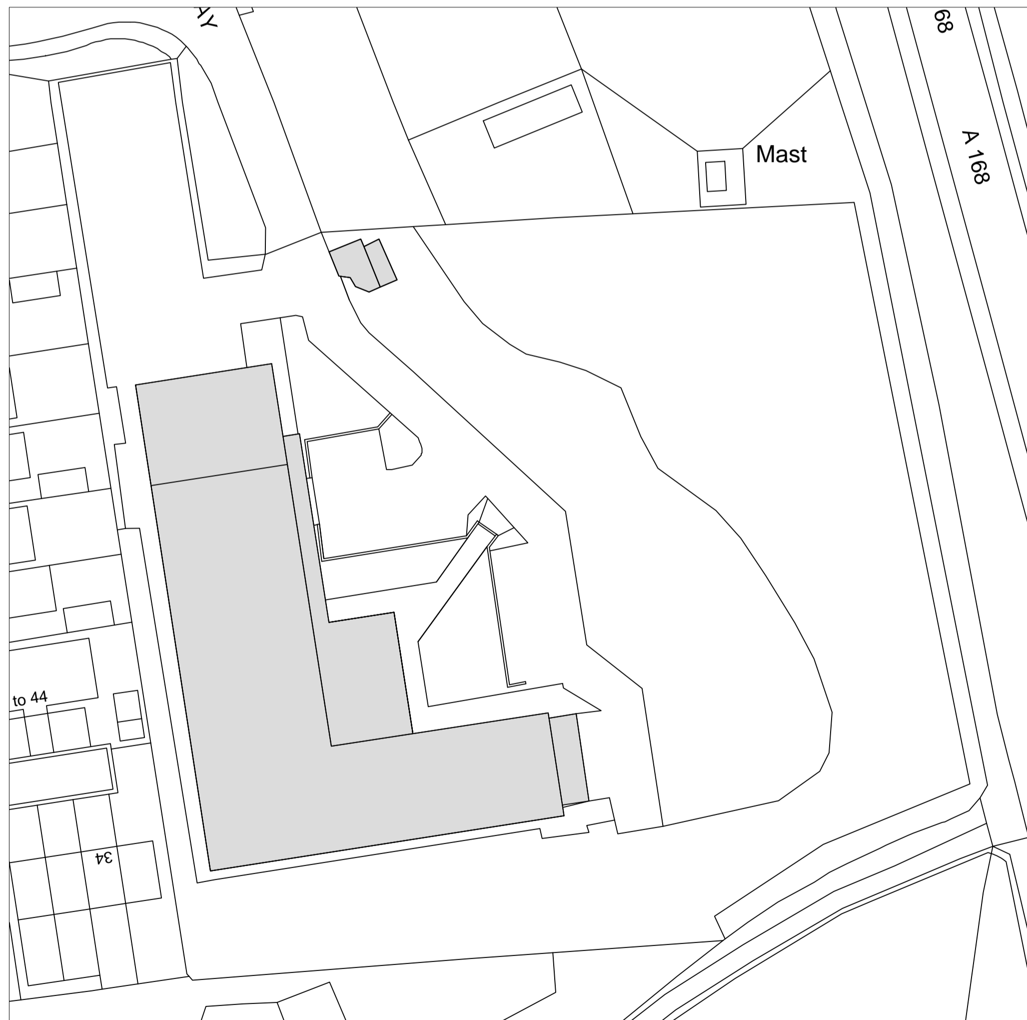
Existing Block Plan SCALE 1:500