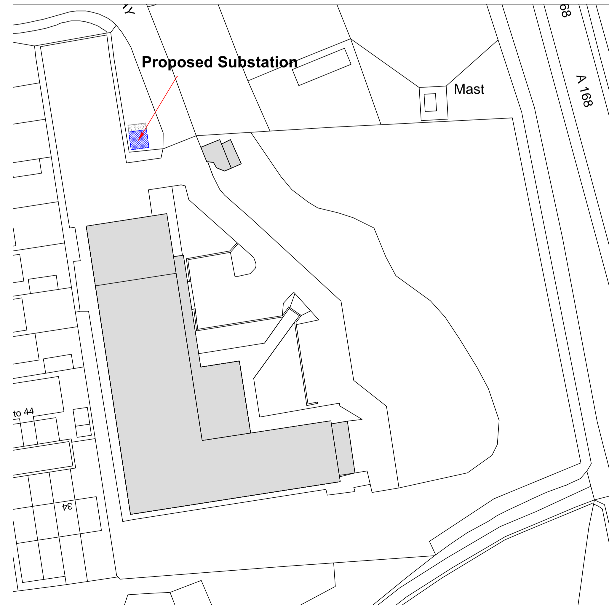
Proposed Block Plan SCALE 1:500