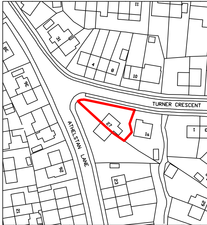
Drainage Survey