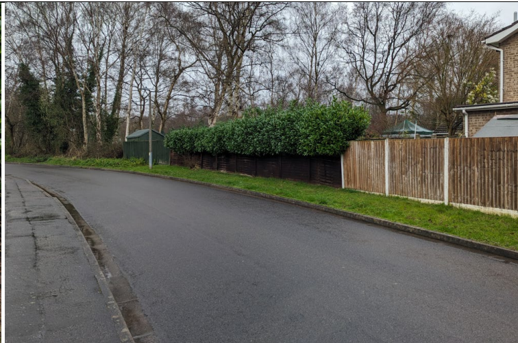
Location of Photograph