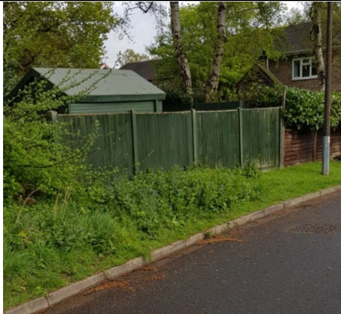
Site Photographs Dated 16/04/2024.