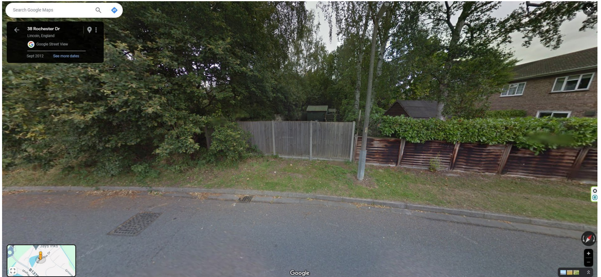
Image dated September 2012 from Rochester Drive towards the fence.