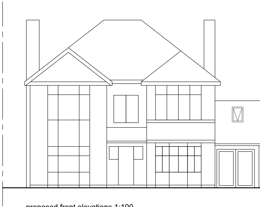
proposed front elevations 1:100