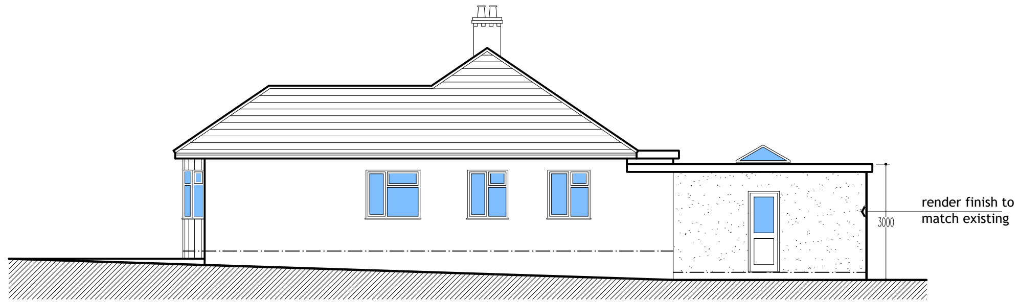
proposed side elevation