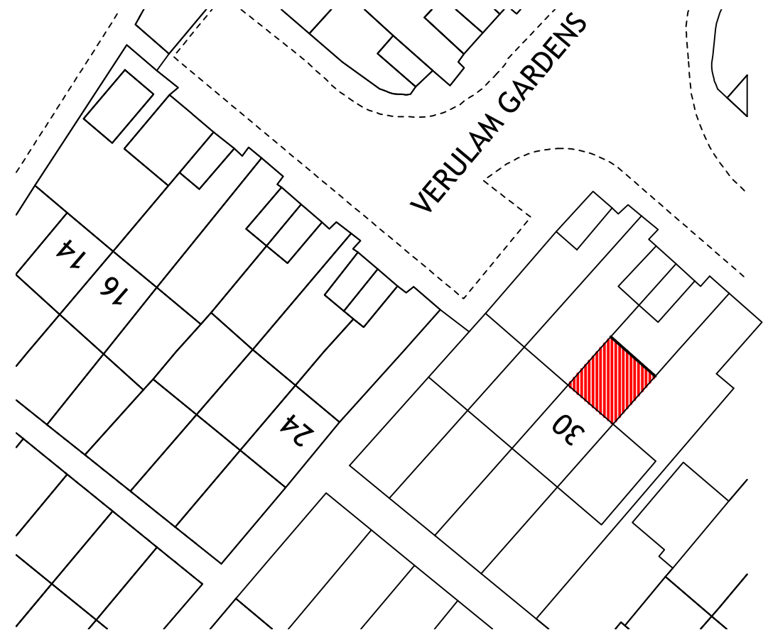
block plan scale 1:500

POSITION OF BOUNDARY LINE/WALL TO ADJACENT PROPERTIES TO BE AGREED IN WRITING BY PARTIES INVOLVED AS SET OUT IN THE PARTY WALL ACT 1996 PRIOR TO WORK COMMENCEMENT.