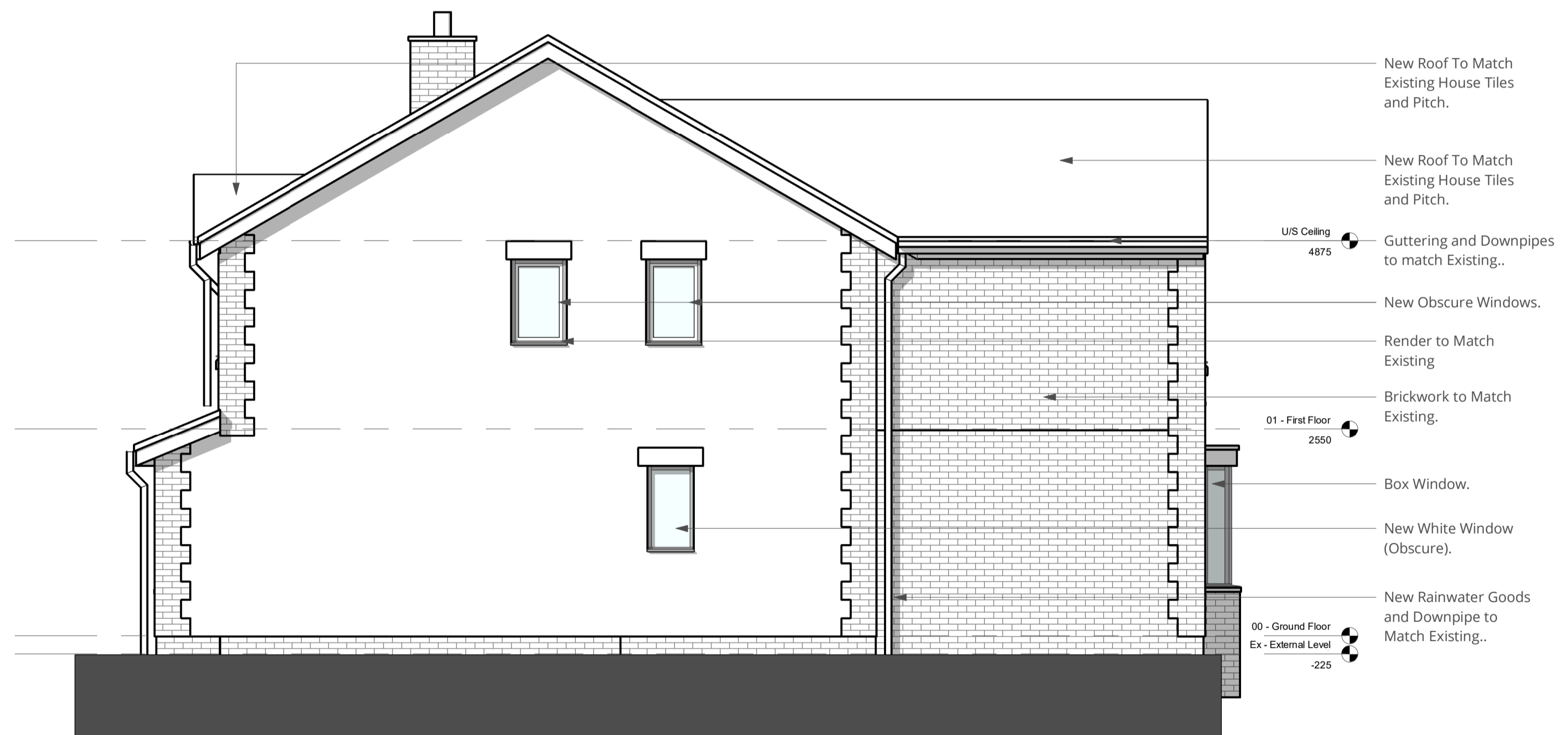
General Arrangement - Side 2 Elevation 1:50