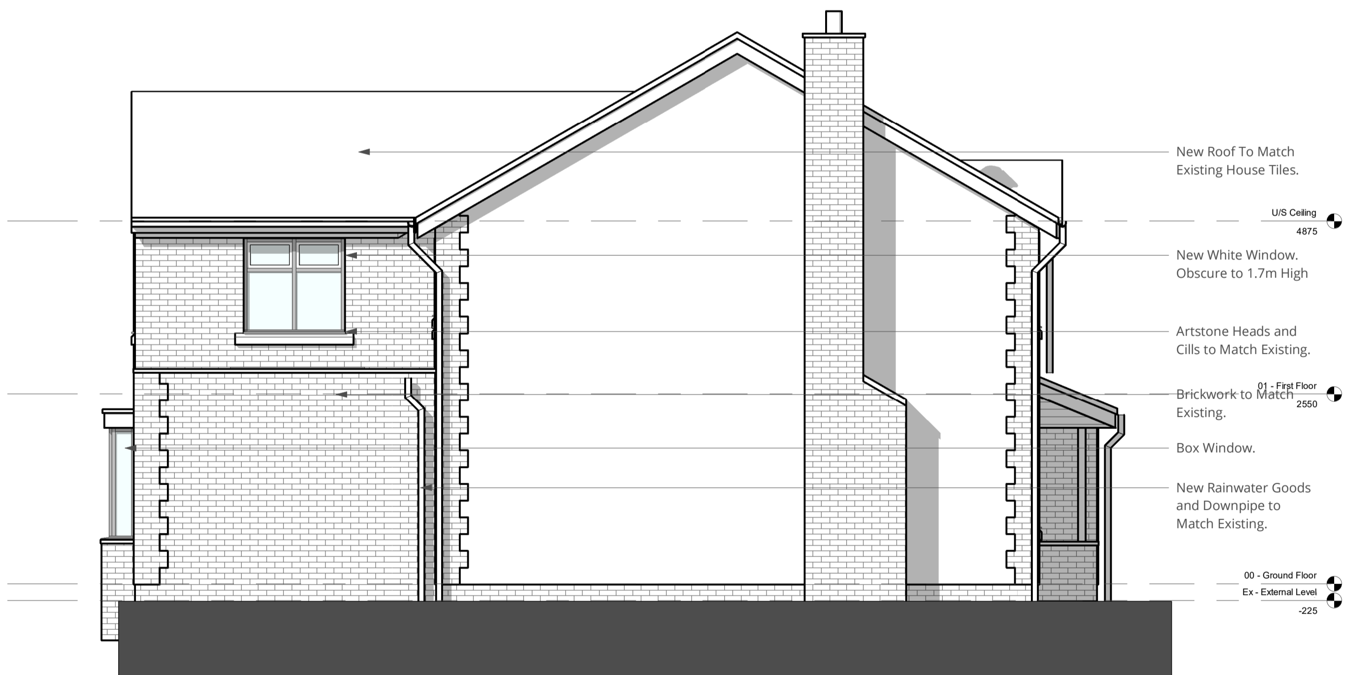
General Arrangement - Side 1 Elevation 1:50