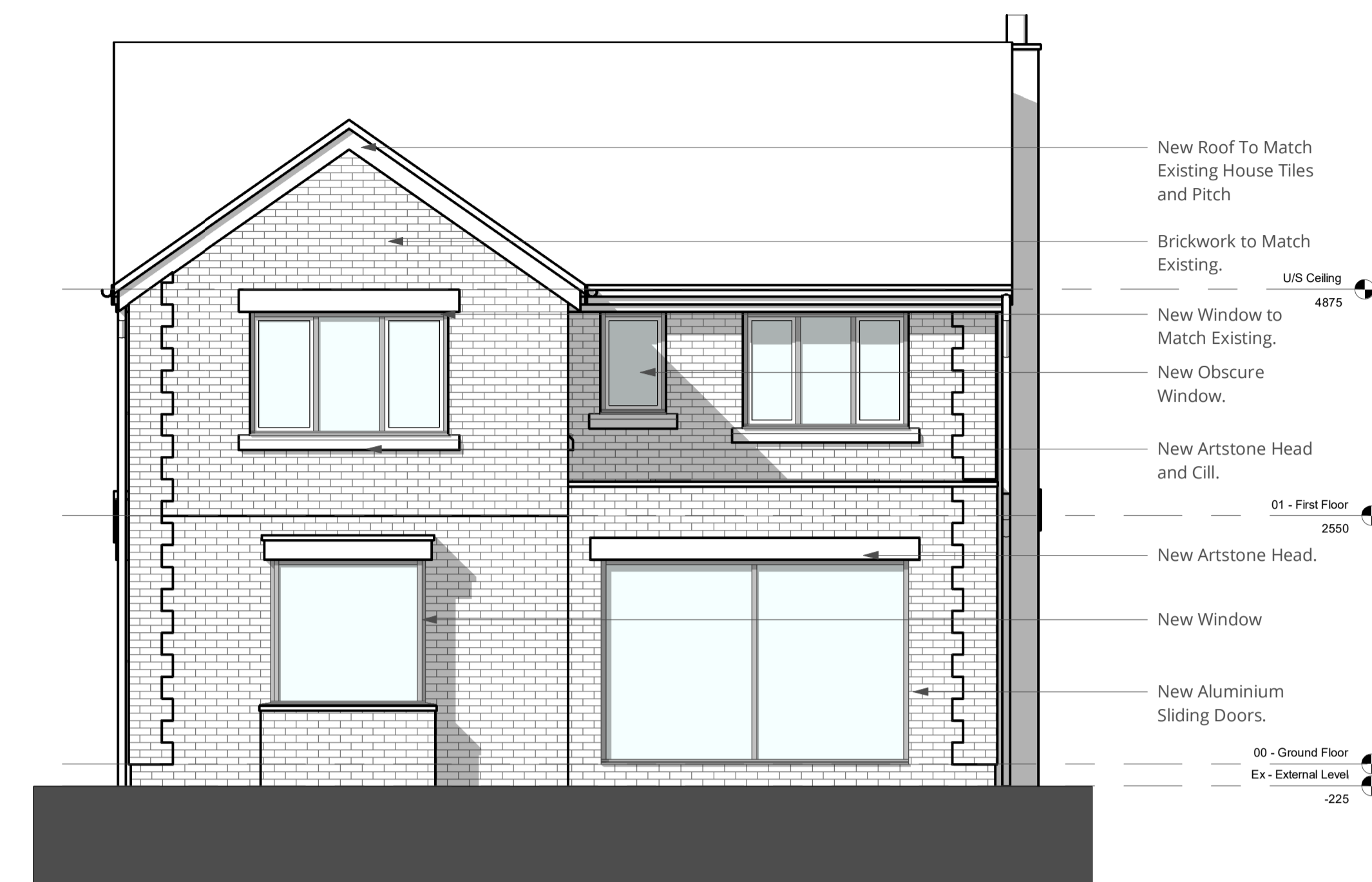
General Arrangement - Rear Elevation 1:50