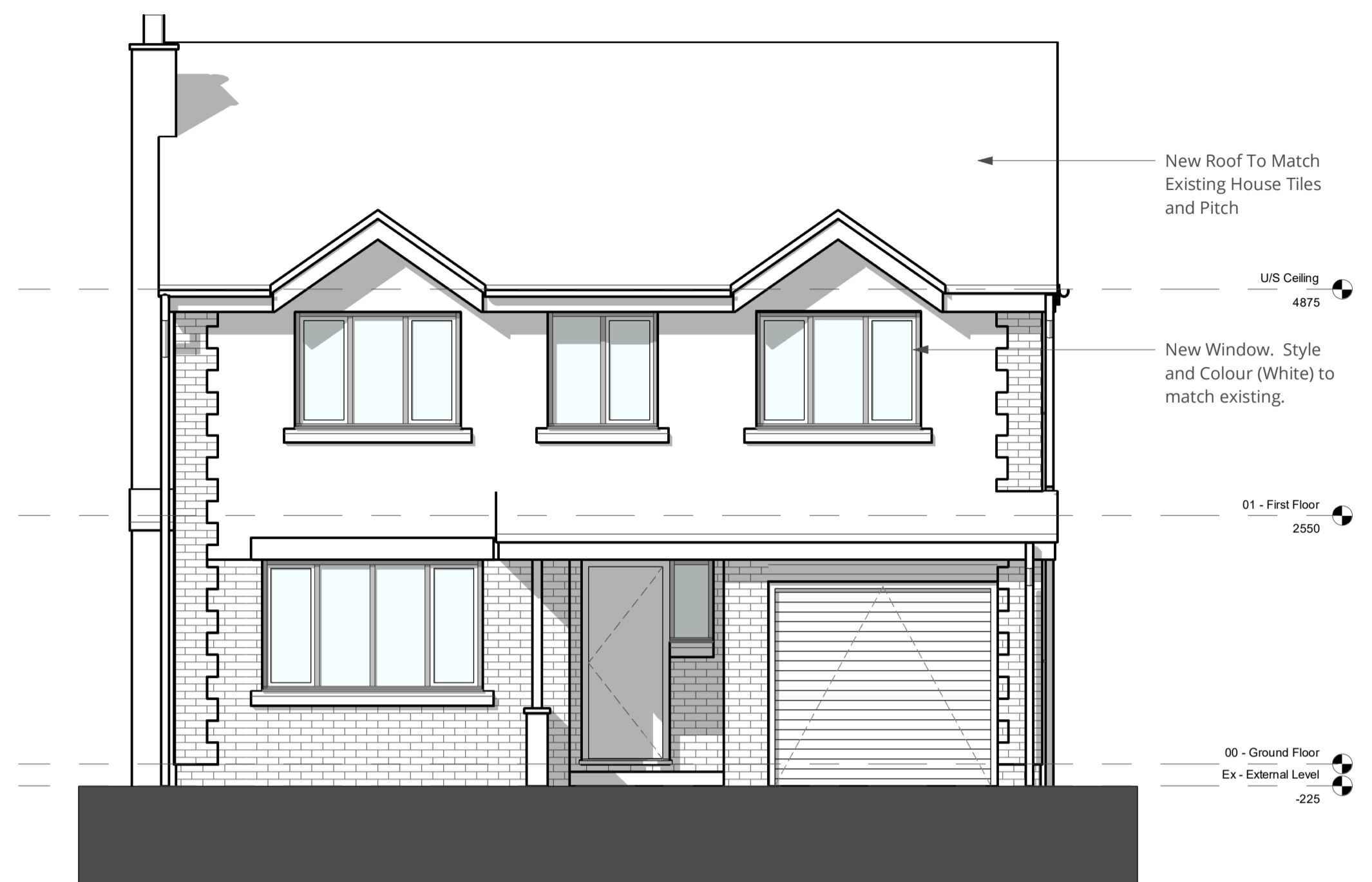
General Arrangement - Front Elevation 1:50