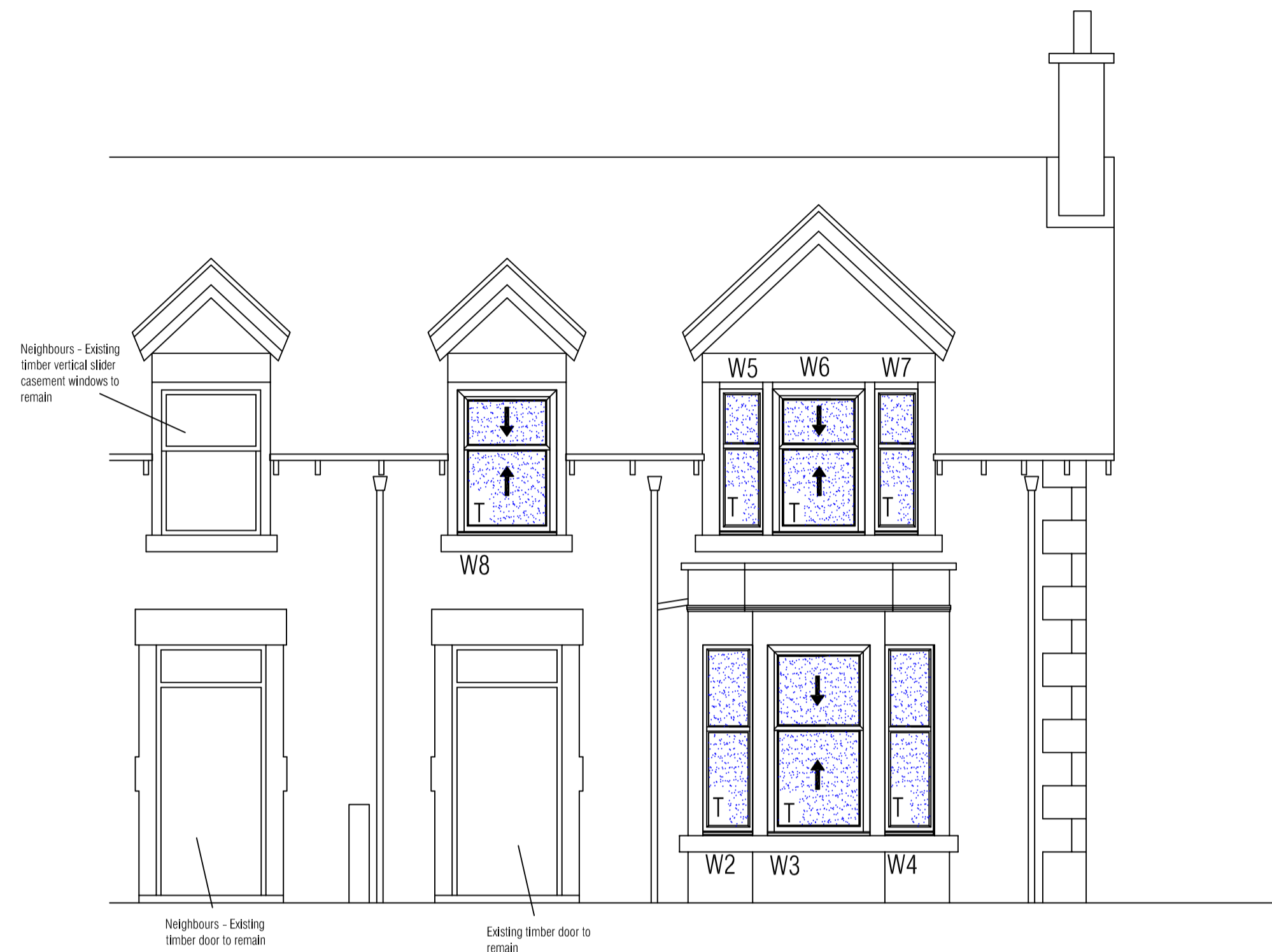
PROPOSED FRONT ELEVATION (COLOURED)