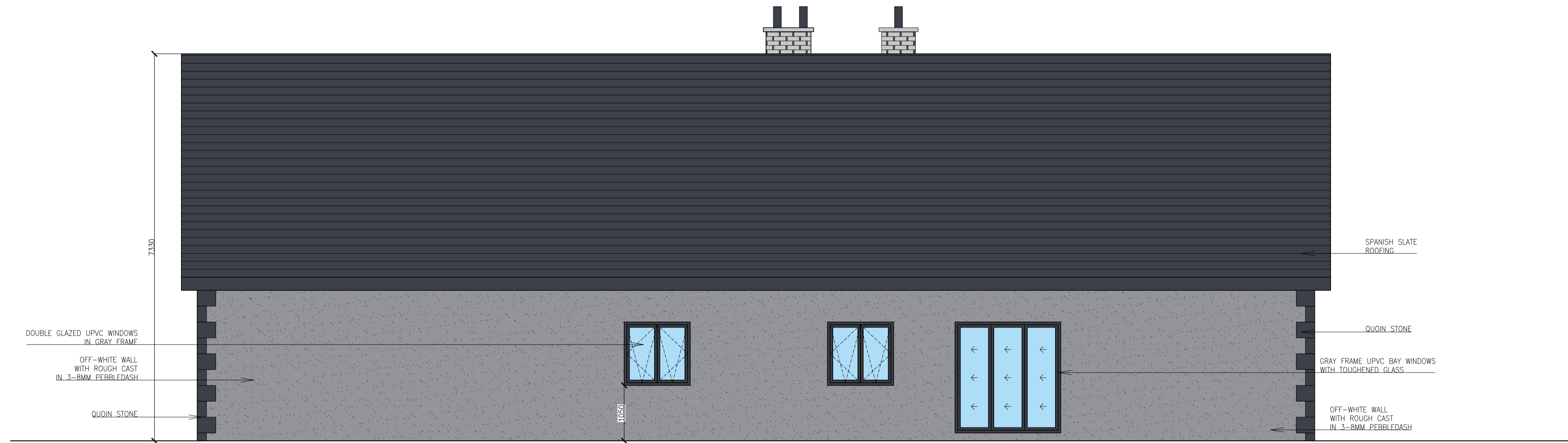
01 West Elevation (Proposed) Scale 1:50 @ A1