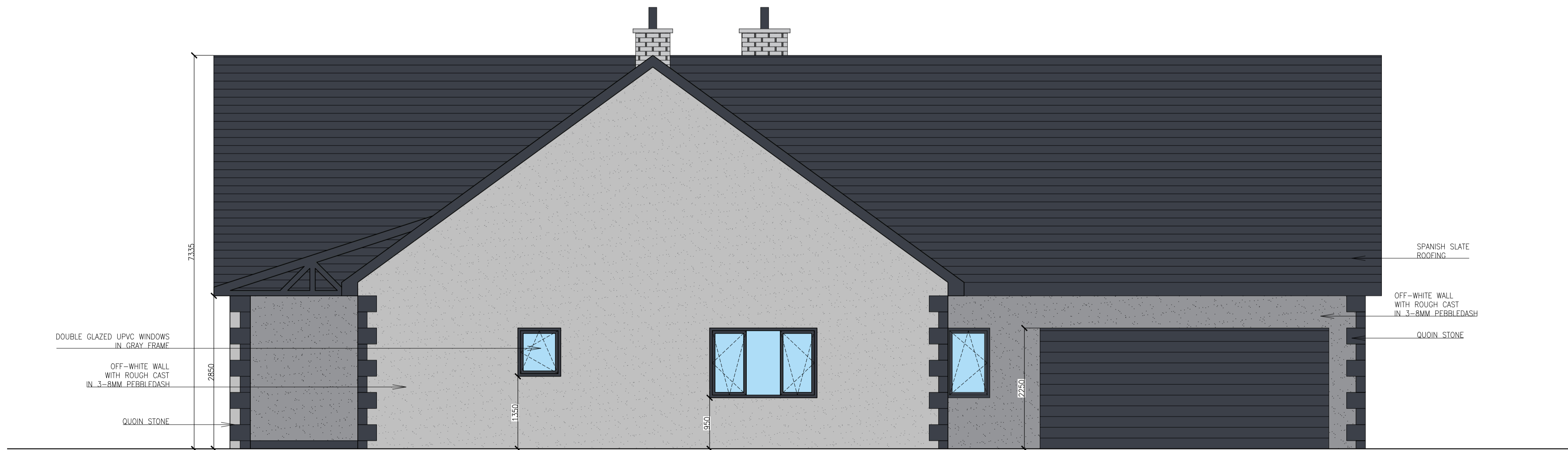
02 East Elevation (Proposed) Scale 1:50 @ A1