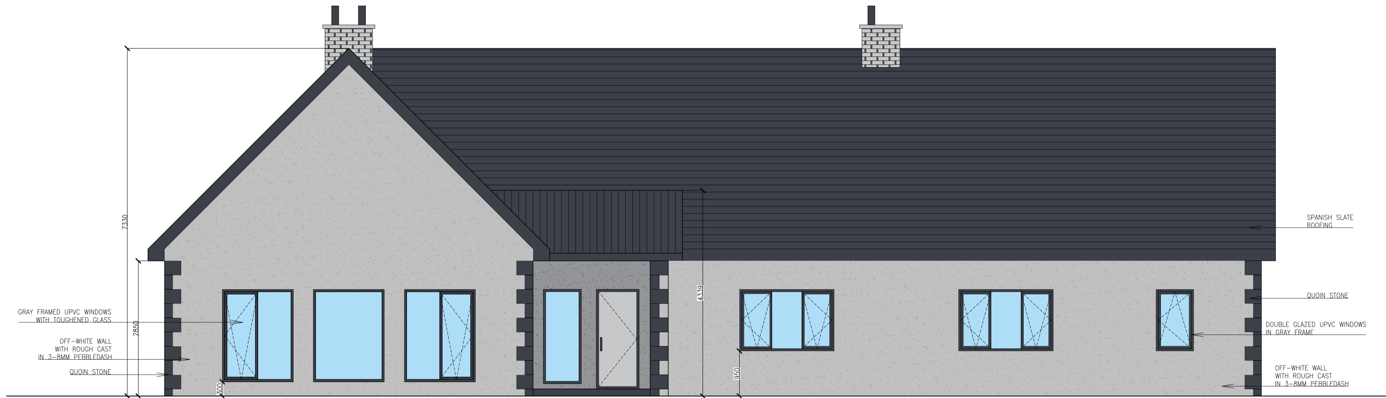
01 South Elevation (Proposed) Scale 1:50 @ A1