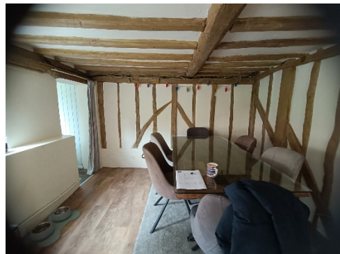
Figure 6 - Existing dining room (east)