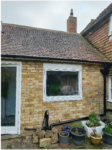
Figure 7 - Existing waste penetrations from kitchen

The proposed scheme seeks to relocate the kitchen to the east end of the current dining room to provide additional storage and space for modern family life in a historic property. The existing kitchen which is housed in a single storey rear extension, which will remain as a utility room with the adjacent cloakroom facilities.