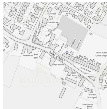
Figure 2 - Local map: MBC Maps