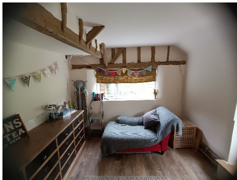
Figure 5 - Existing dining room (west)