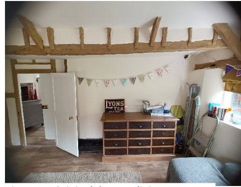
Figure 4 - Original door to dining room

Original internal exposed timber work and doors (approximately 1.7m high) are present.