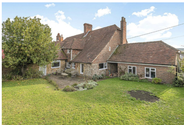
Figure 3 - Existing Rear Elevations

The property appears to be constructed from a mix of solid masonry and timber framed construction (structural survey 2021) with tile hanging at first floor level to the side and front elevations. The rear elevations are formed from ragstone and brickwork detailing around the openings and a banding at plinth level.