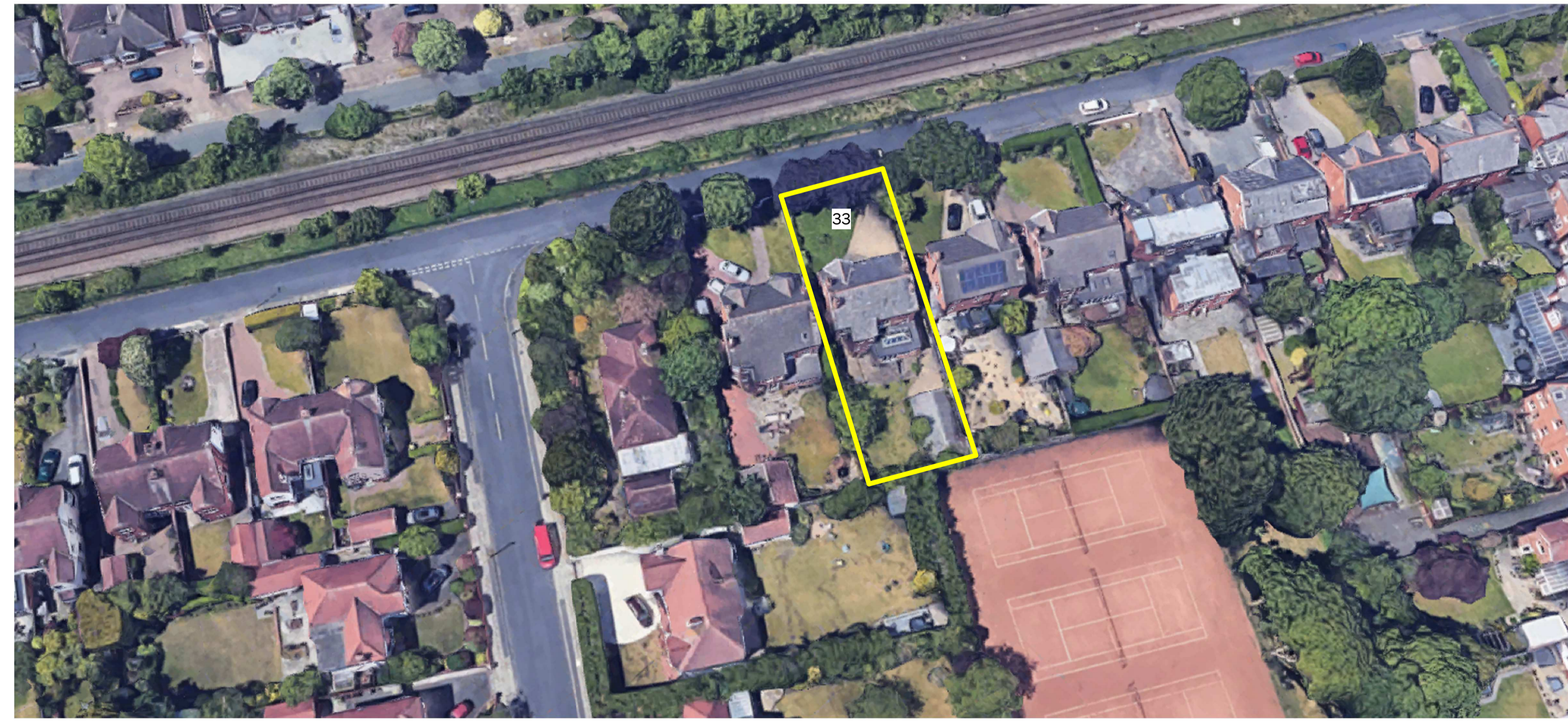
FRONT AERIAL VIEW | (GOOGLE MAPS)