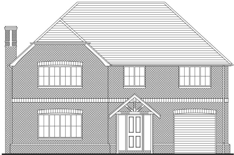
Existing Front Elevation Scale 1:100