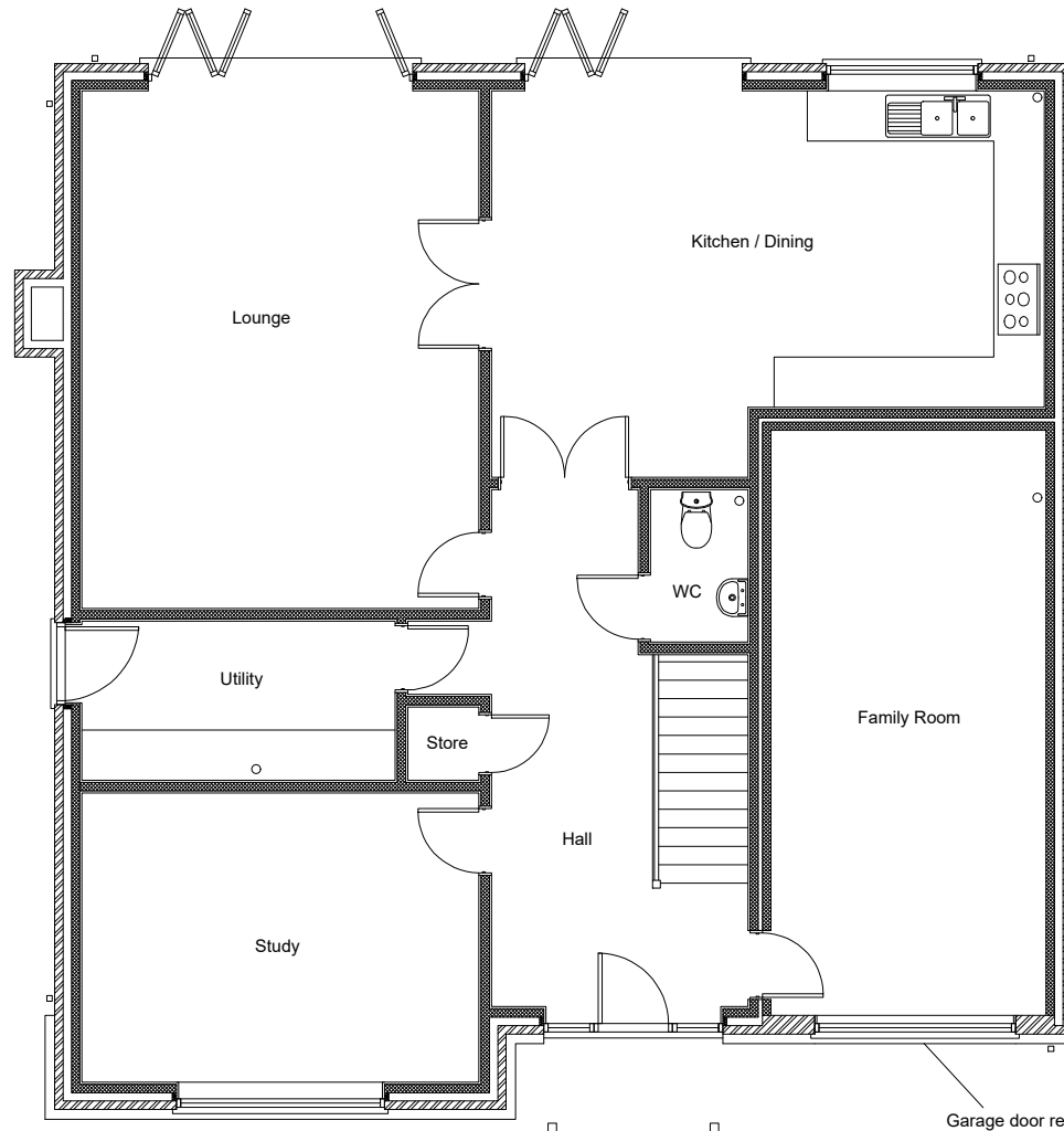
Proposed Ground Floor Plan Scale 1:100

Garage door removed and replaced with new window