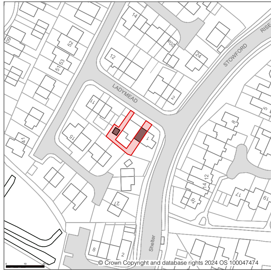
Site Location Plan 1:1250