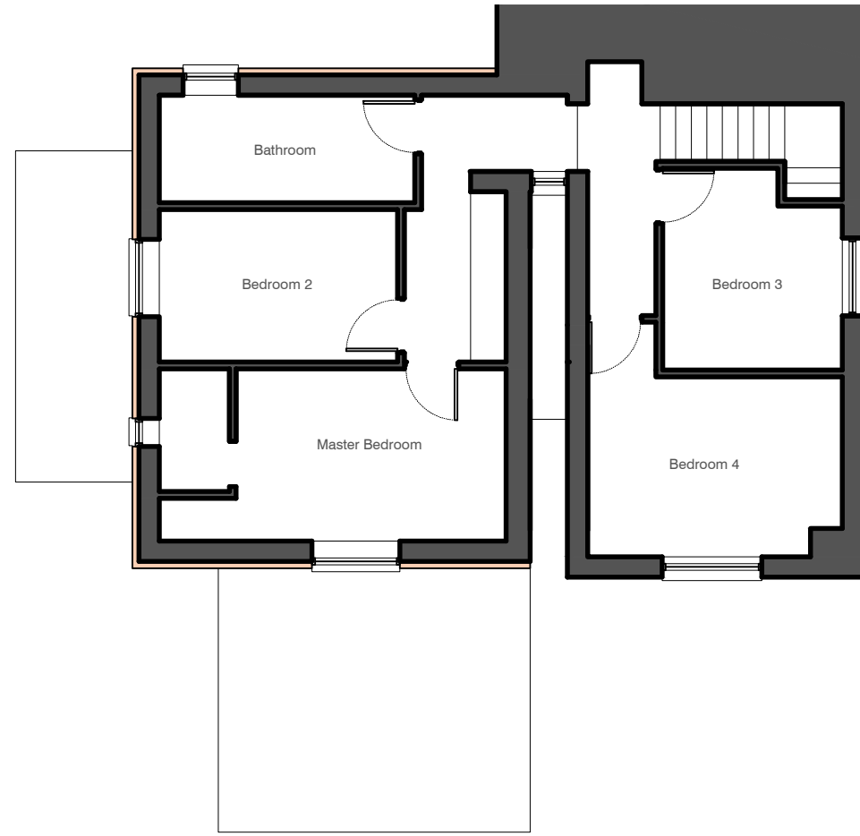
First Floor Layout