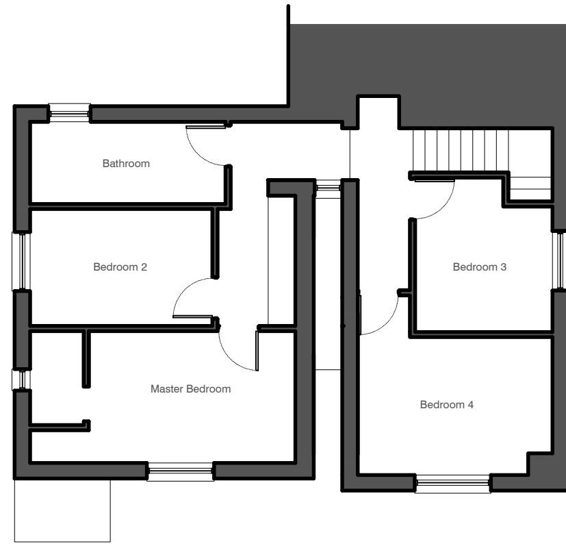
First Floor Layout