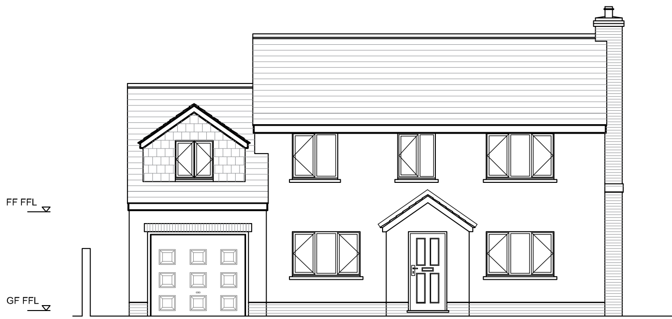
NORTH EAST FACING ELEVATION 1:50@A1