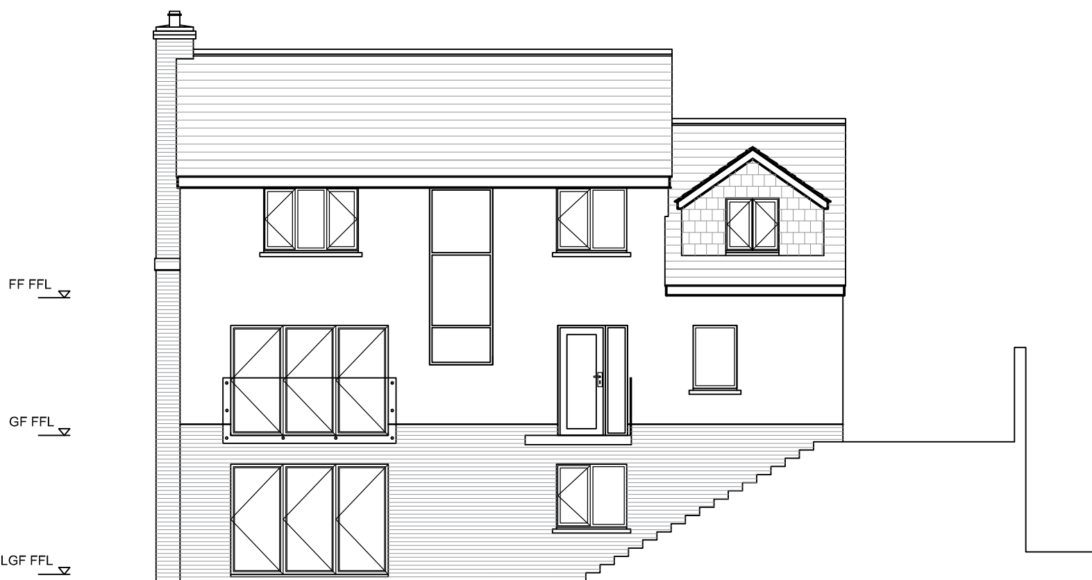
SOUTH WEST FACING ELEVATION 1:50@A1