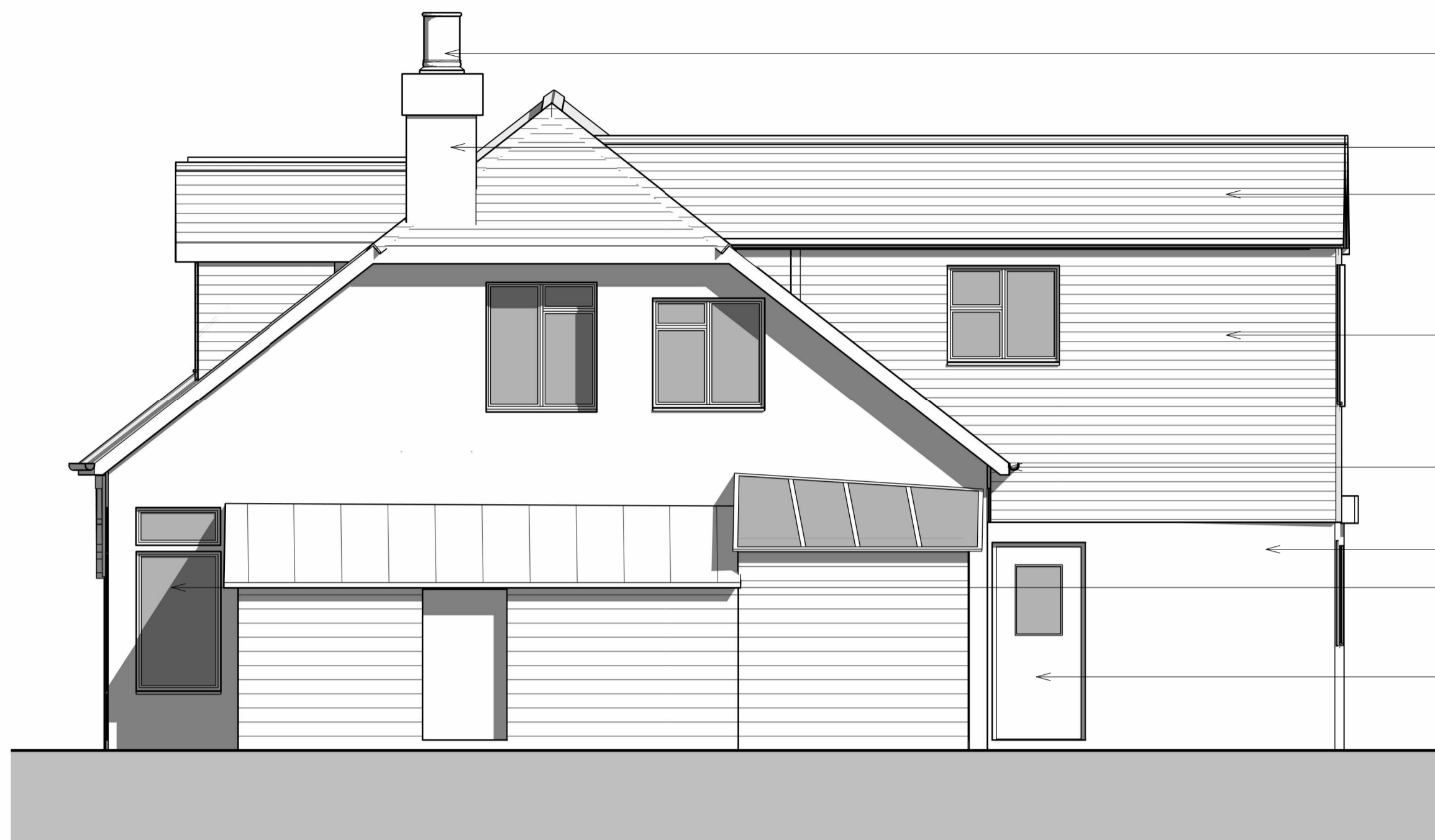
1 Existing North East Elevation 1 : 50