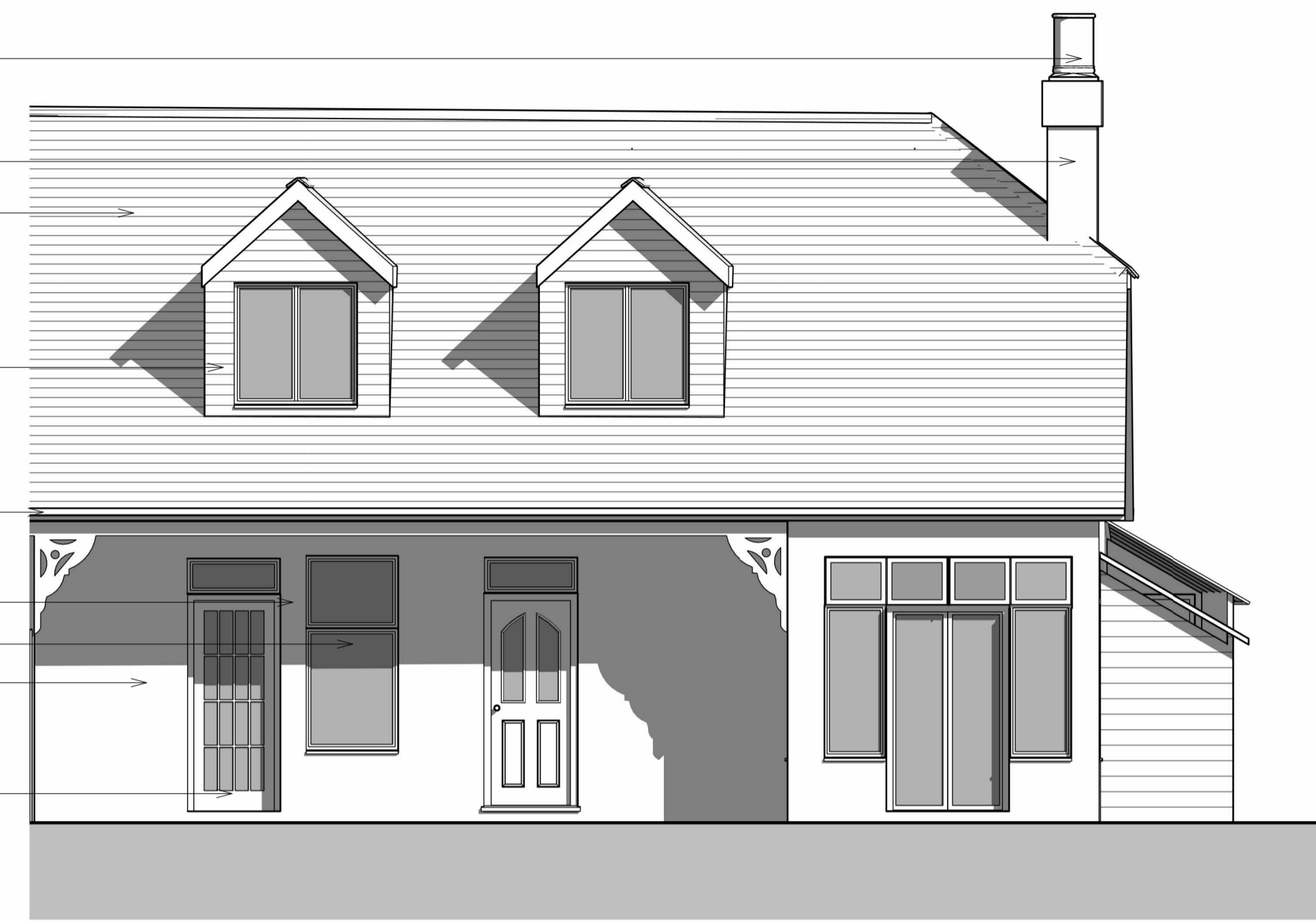
2 Existing South East Elevation 1 : 50