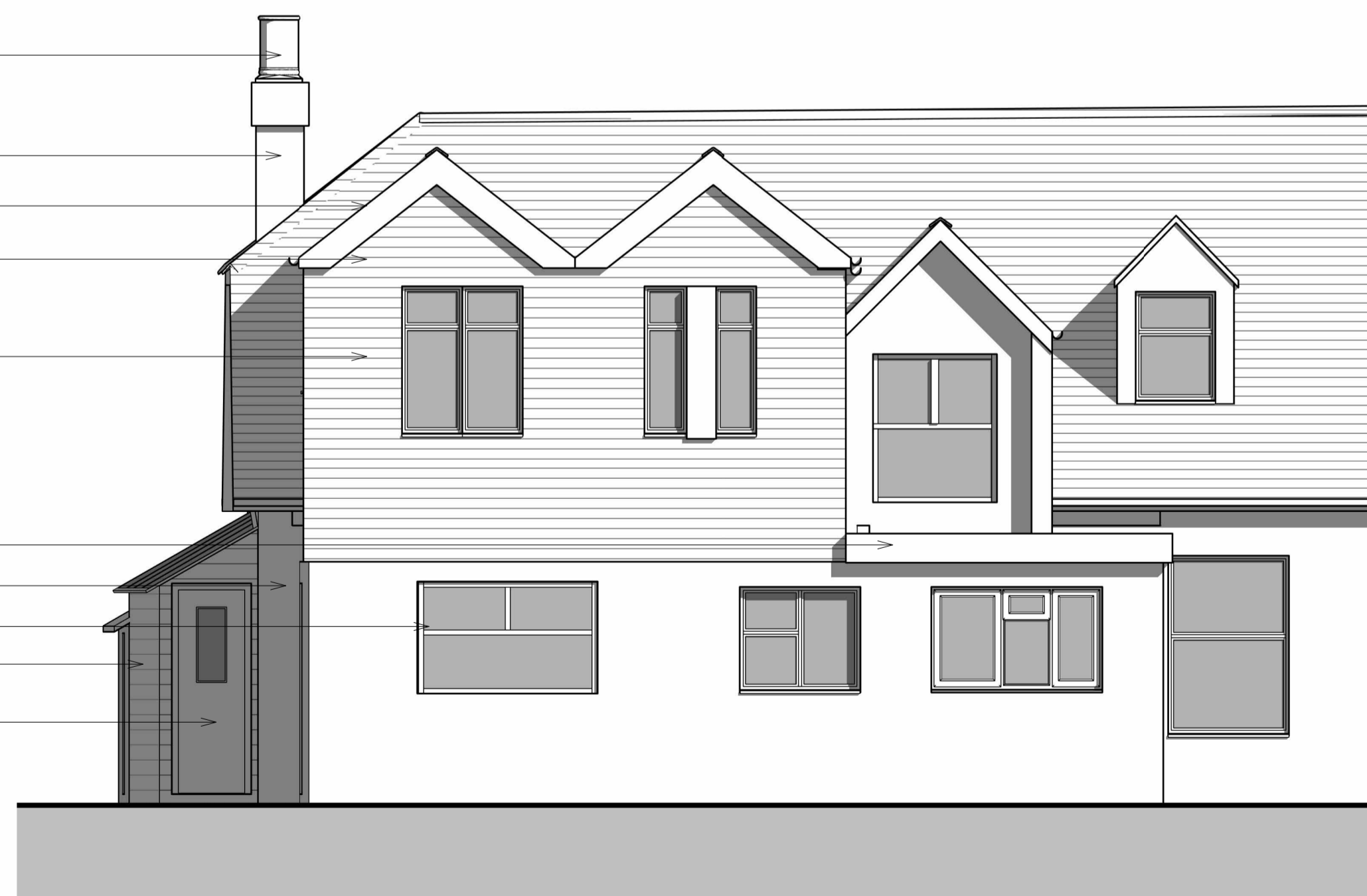
4 Existing North West Elevation 1 : 50