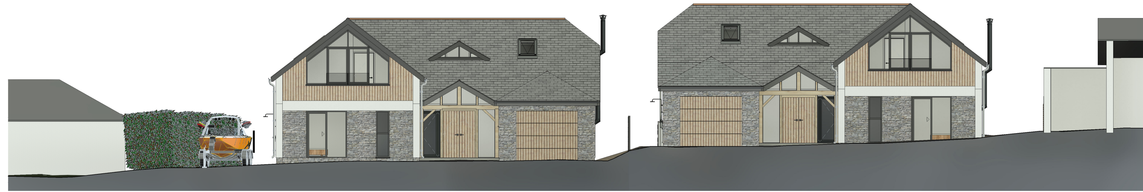
1 Street Elevation- North Elevation- Front 1 : 100