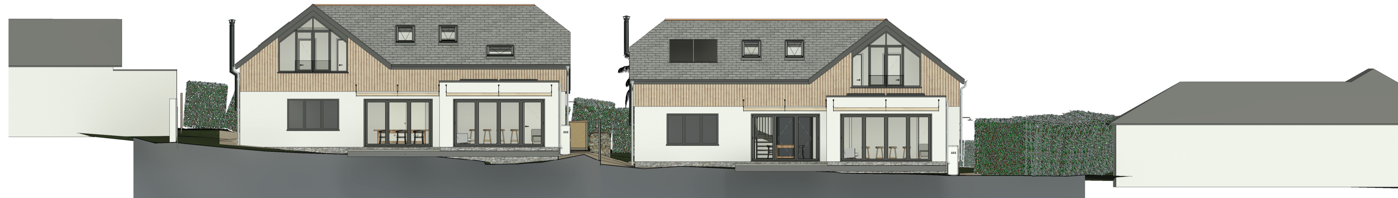
2 Site Section- South Elevation- Rear 1 : 100