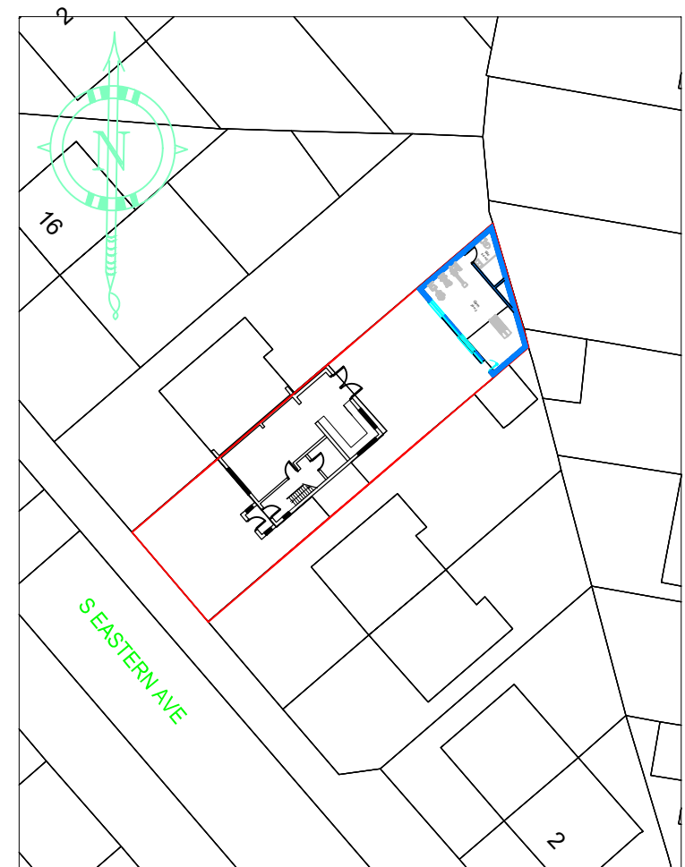
SITE PLAN SCALE: 1/500