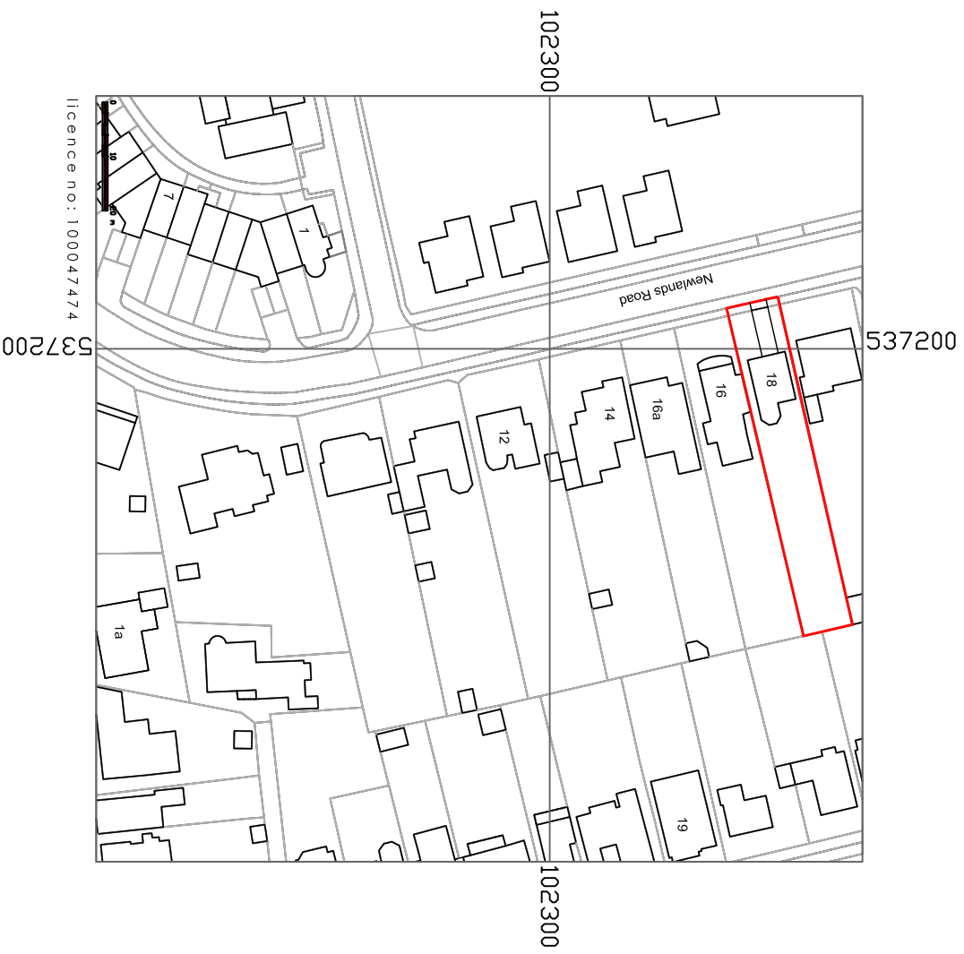
location plan 1:1250