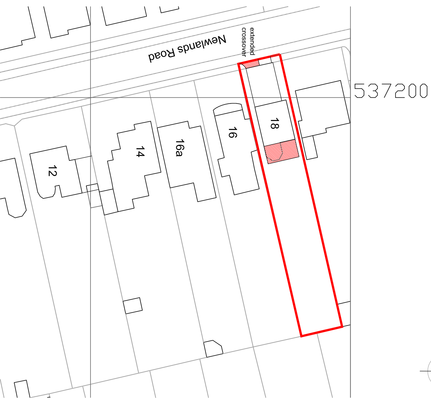
block plan 1:500