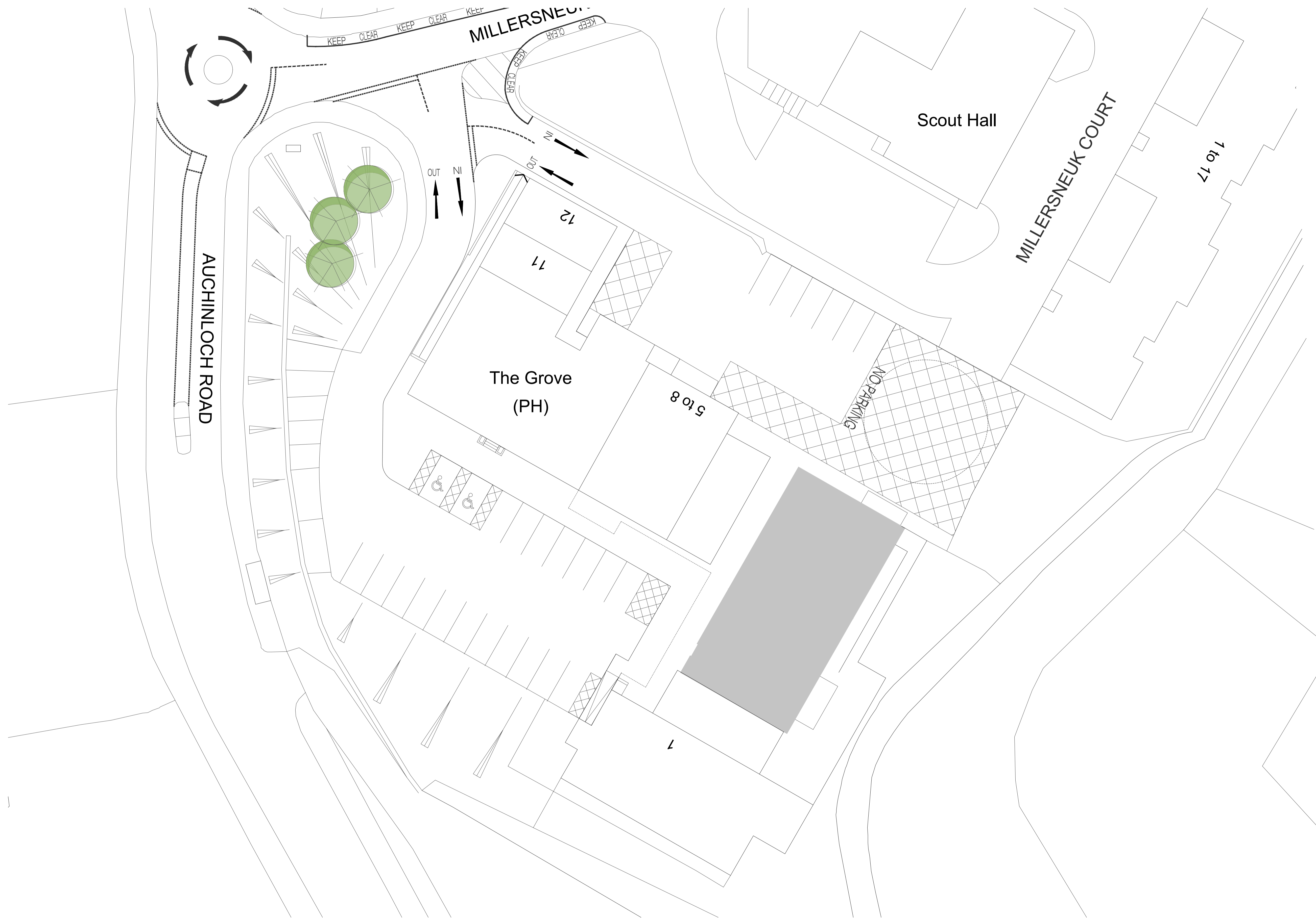
Existing Site Plan Scale 1:200 @ A1