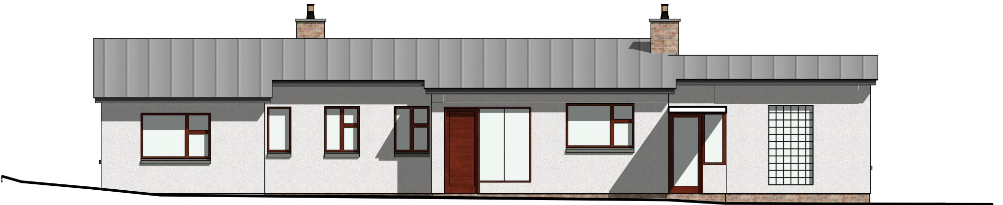
NNE Elevation 1:100