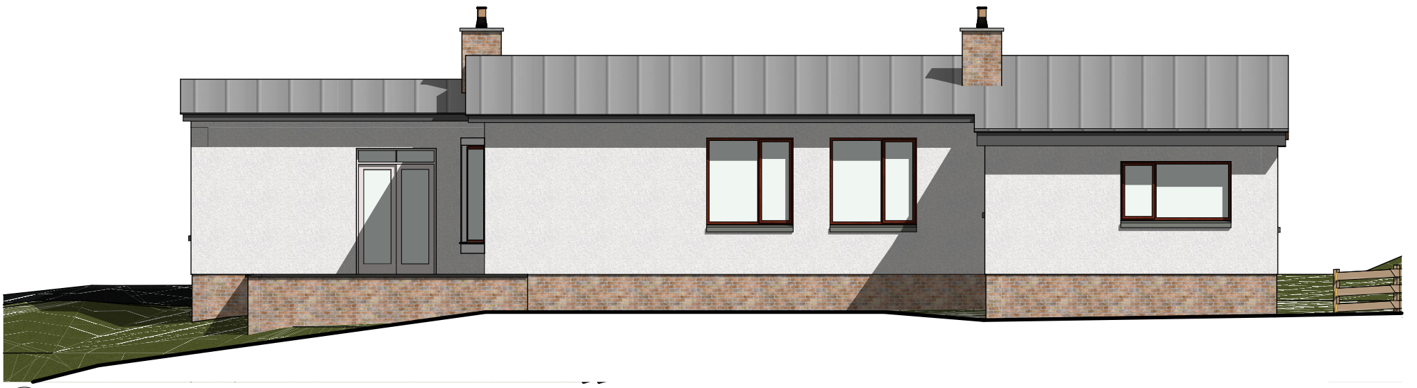
SSW Elevation 1:100