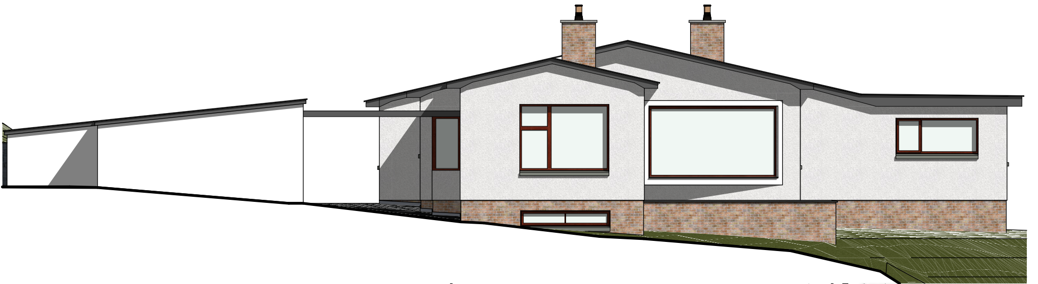
WNW Elevation 1:100