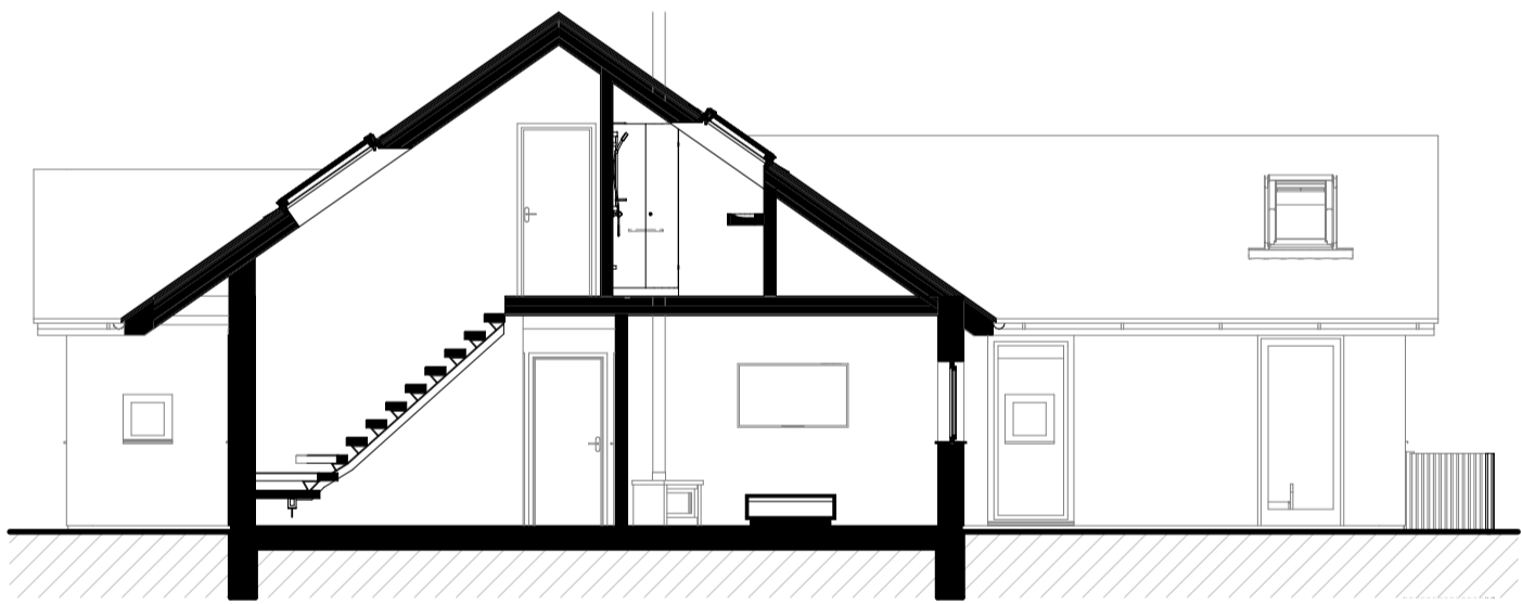
C Section 1:100