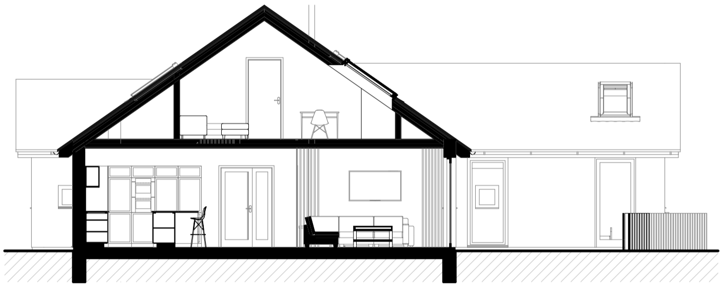
B Section 1:100