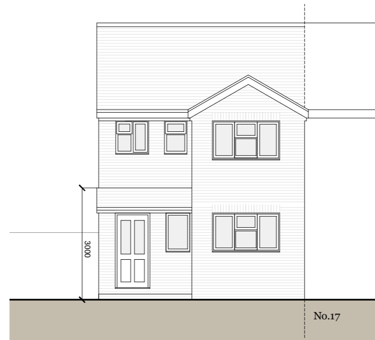
Front Elevation (west)