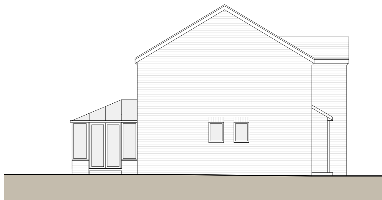
Side Elevation (north)