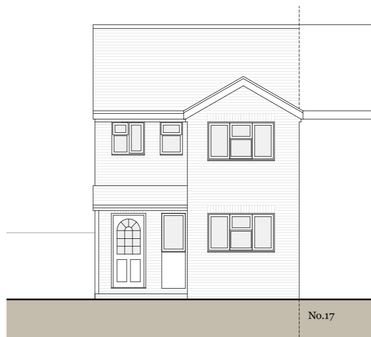
Front Elevation (west)