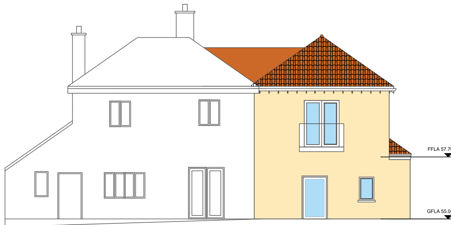
Proposed Western Elevation

Responsibility is not accepted for errors made by others in scaling from this drawing. All construction information should be taken from figured dimensions only. All dimensions are in millimetres unless otherwise stated. All dimensions to be verified on site before proceeding with the work. Any discrepancies to be notified in writing to Architect immediately