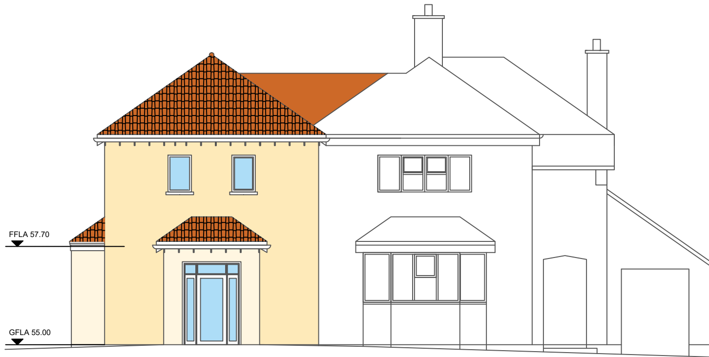
Proposed Eastern Elevation