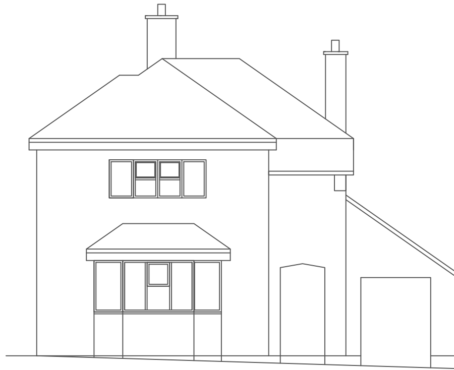
Existing Eastern Elevation