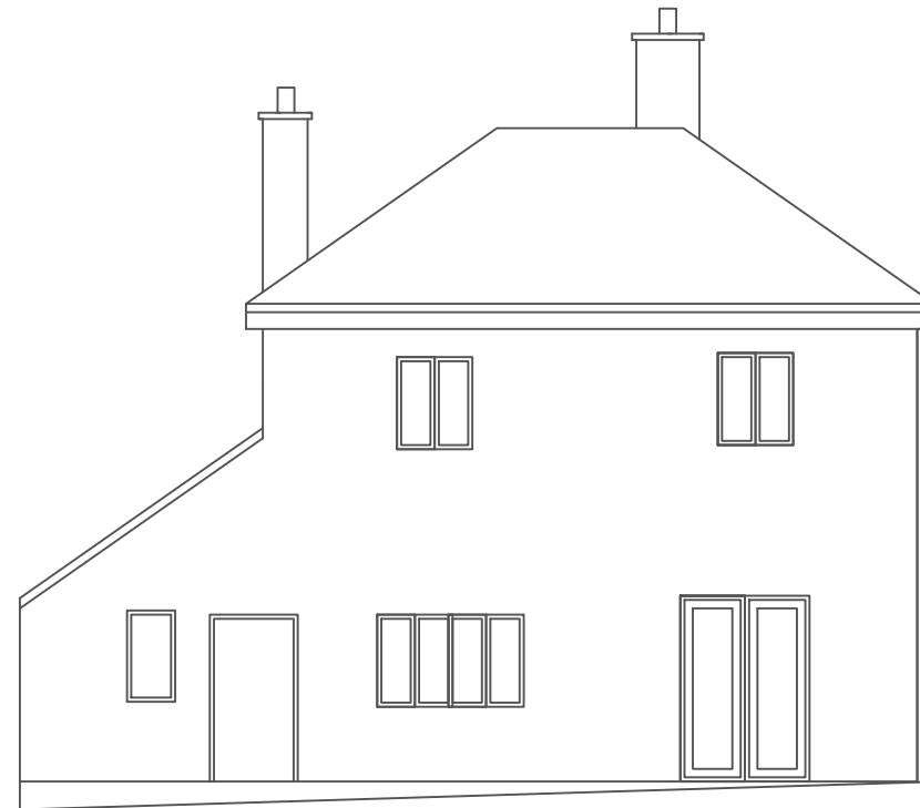
Existing Western Elevation

Responsibility is not accepted for errors made by others in scaling from this drawing. All construction information should be taken from figured dimensions only. All dimensions are in millimetres unless otherwise stated. All dimensions to be verified on site before proceeding with the work. Any discrepancies to be notified in writing to Architect immediately