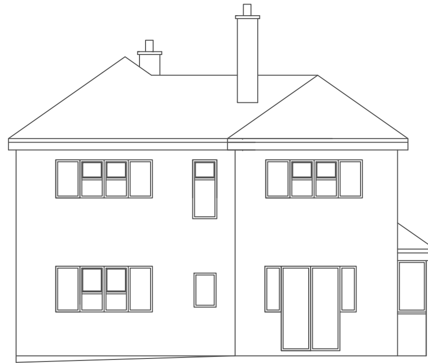
Existing Southern Elevation