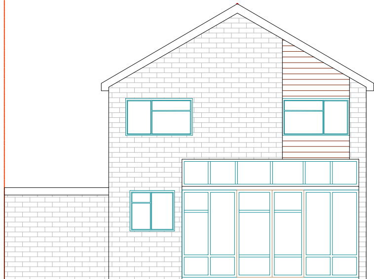
6 EXISTING REAR ELEVATION SCALE 1:100 @ A3