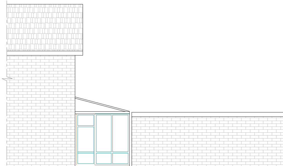
7 EXISTING SIDE II ELEVATION SCALE 1:100 @ A3