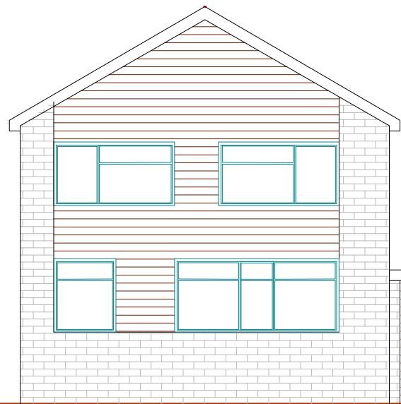
4 EXISTING FRONT ELEVATION SCALE 1:100 @ A3

General Notes: All dimensions are in millimeters unless noted otherwise. All dimensions to be verified on site. For any discrepancies and omissions, it is recipient's responsibility to verify the same specifically with the designer. The copyright of this drawing is held by ALL1HOUSE. No unauthorized use or copies are permitted without our consent.