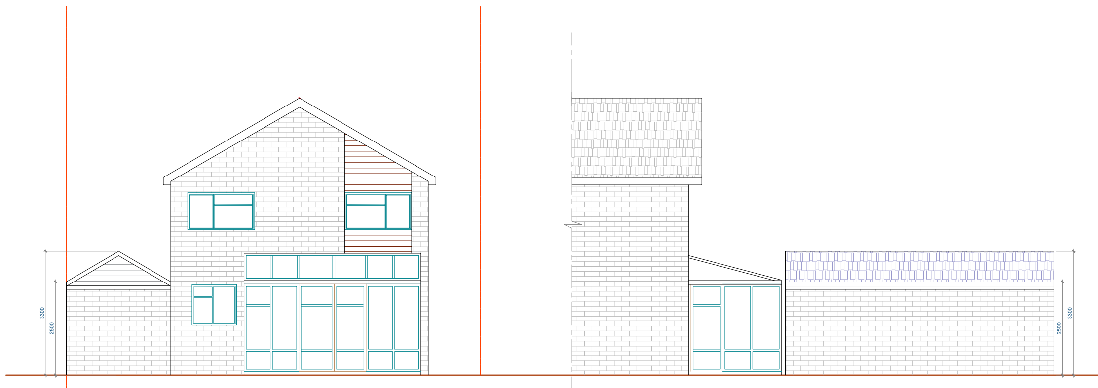
6 PROPOSED REAR ELEVATION SCALE 1:100 @ A3