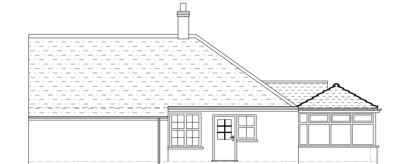
EXISTING SIDE ELEVATION - 'B'

PROPOSED DORMER TO BUNGALOW, SIDE EXTENSION WITH REAR DORMER AND OUT-BUILDING AT REAR OF GARDEN