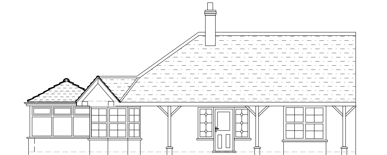
EXISTING SIDE ELEVATION - 'A'