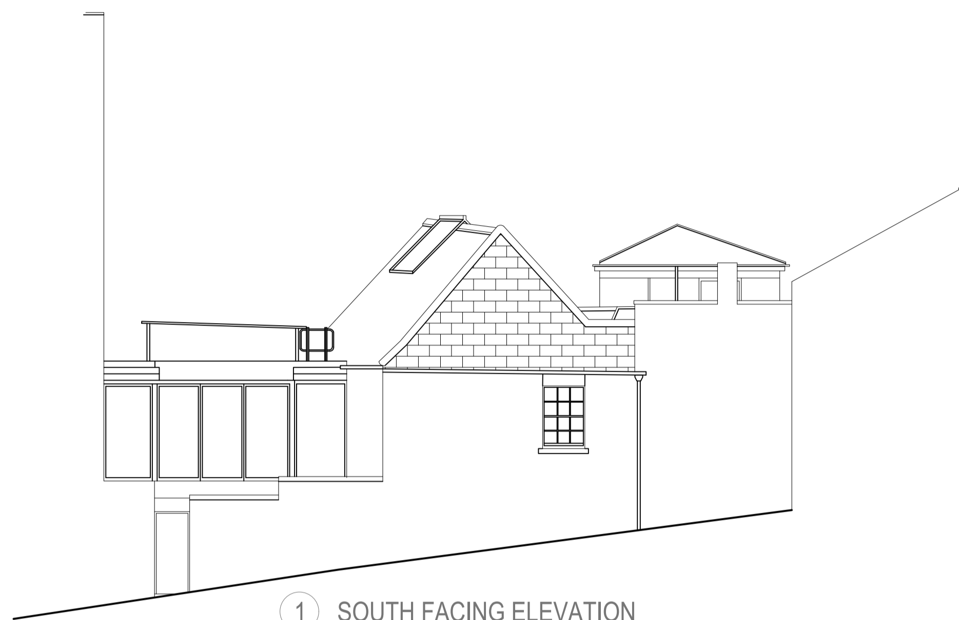
① SOUTH FACING ELEVATION