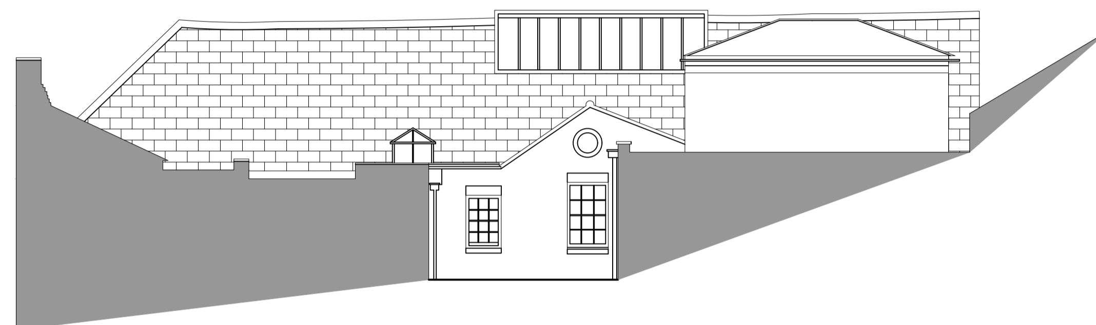
② EAST FACING ELEVATION