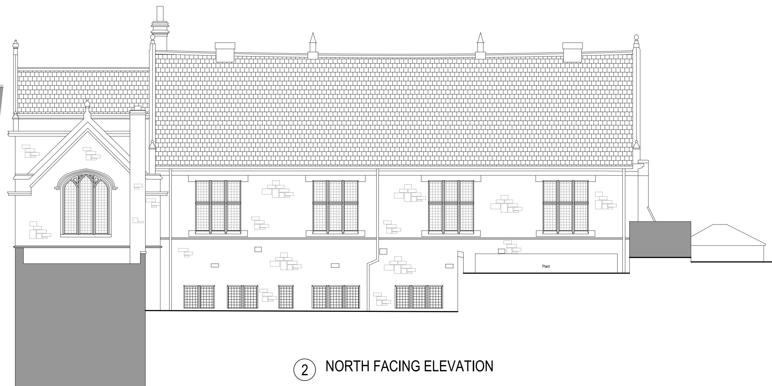
② NORTH FACING ELEVATION