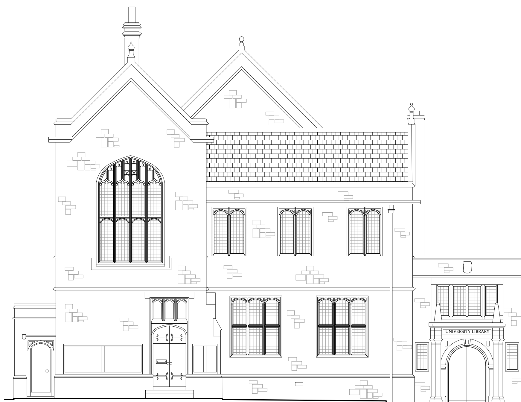
① EAST FACING ELEVATION