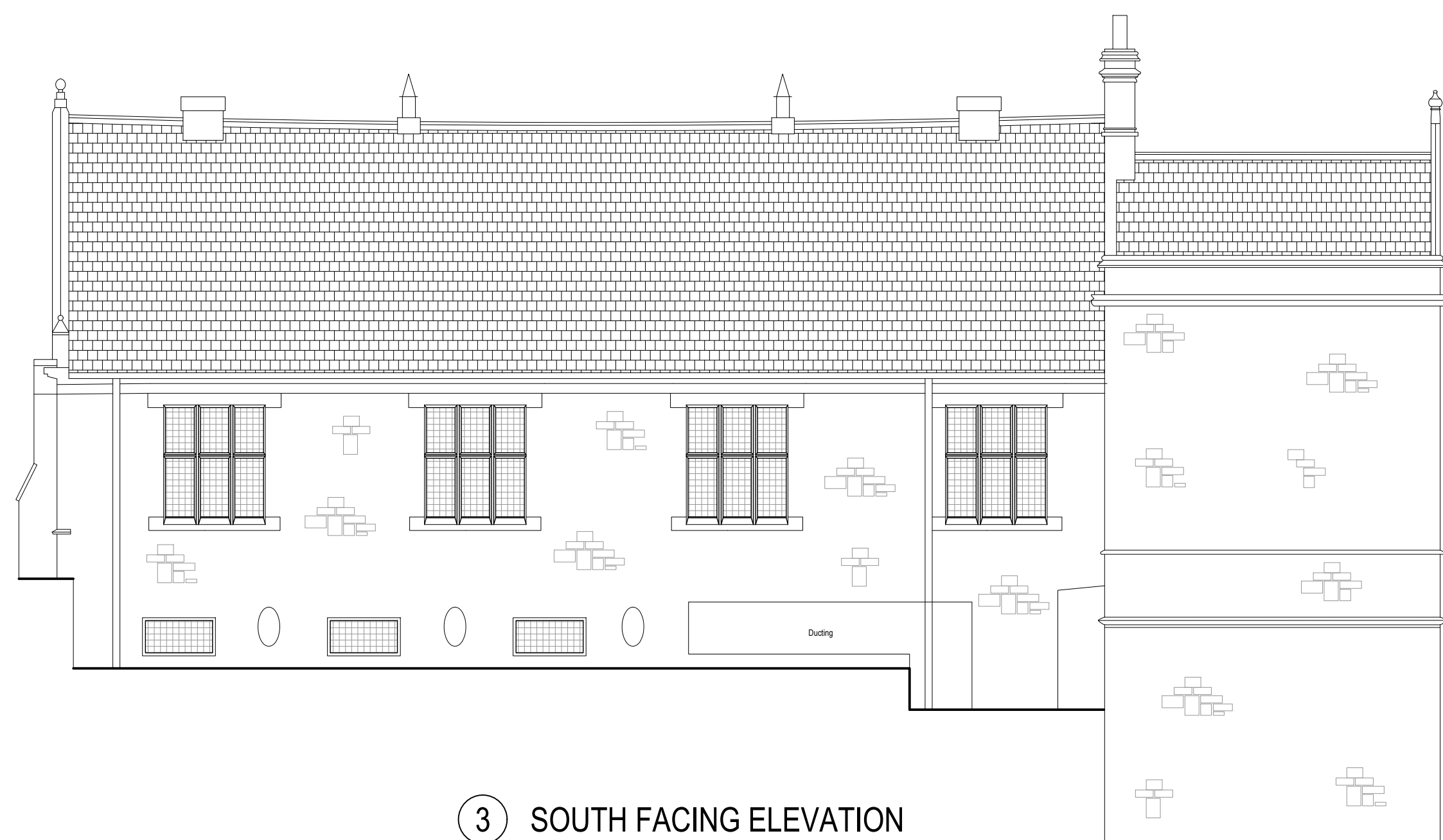
③ SOUTH FACING ELEVATION