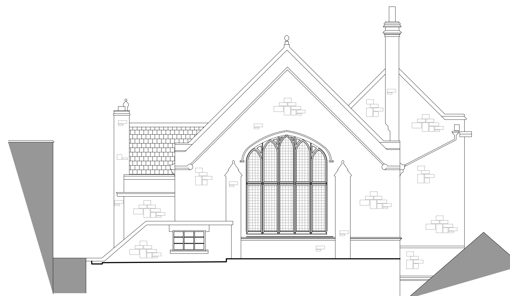
④ WEST FACING ELEVATION