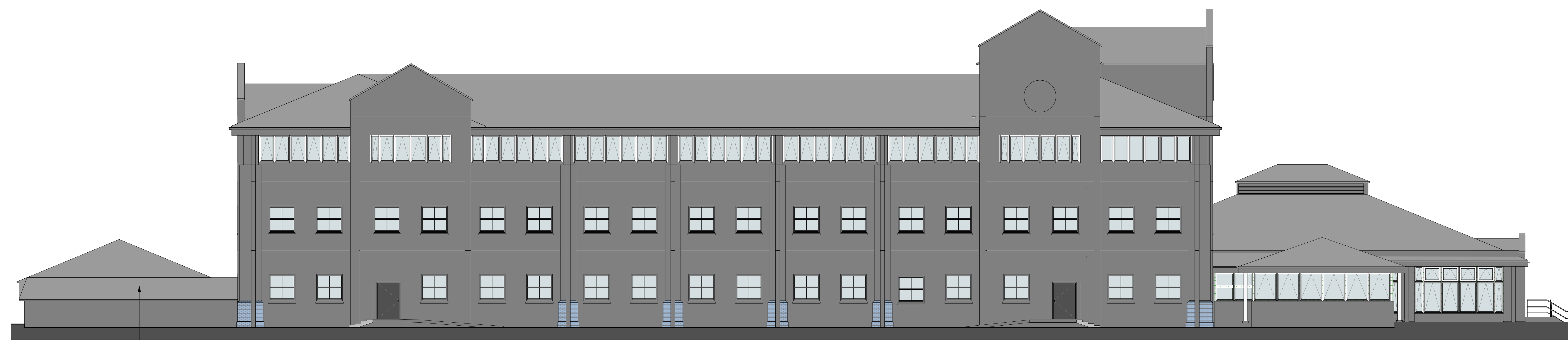
8 Existing Elevation 4 Scale:- 1 : 100