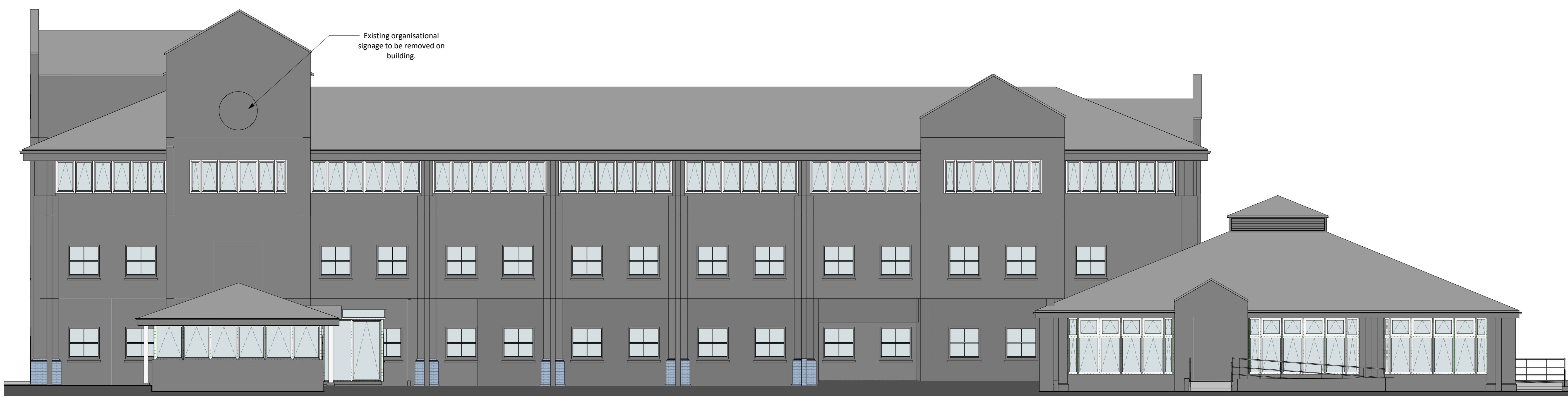
7 Existing Elevation 3 Scale:- 1 : 100

GENERAL NOTES: Drawings of the existing building are based on a 3D building survey instructed by Identity Consult, 1097 - Identity Consult - DU Boldon House - Revit Model - CKS' received from CKS.