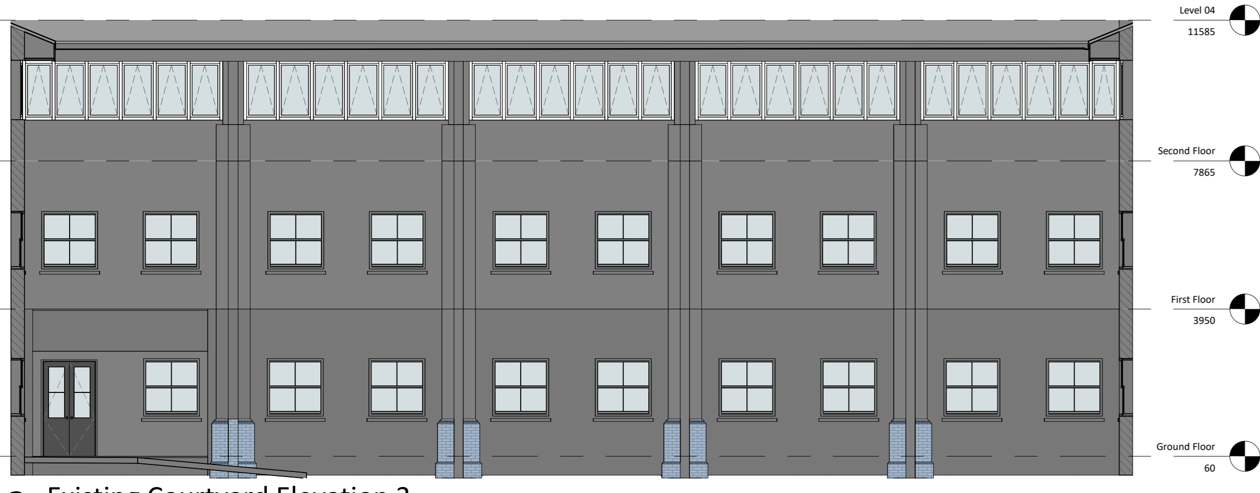
3 Existing Courtyard Elevation 3 Scale:- 1 : 100