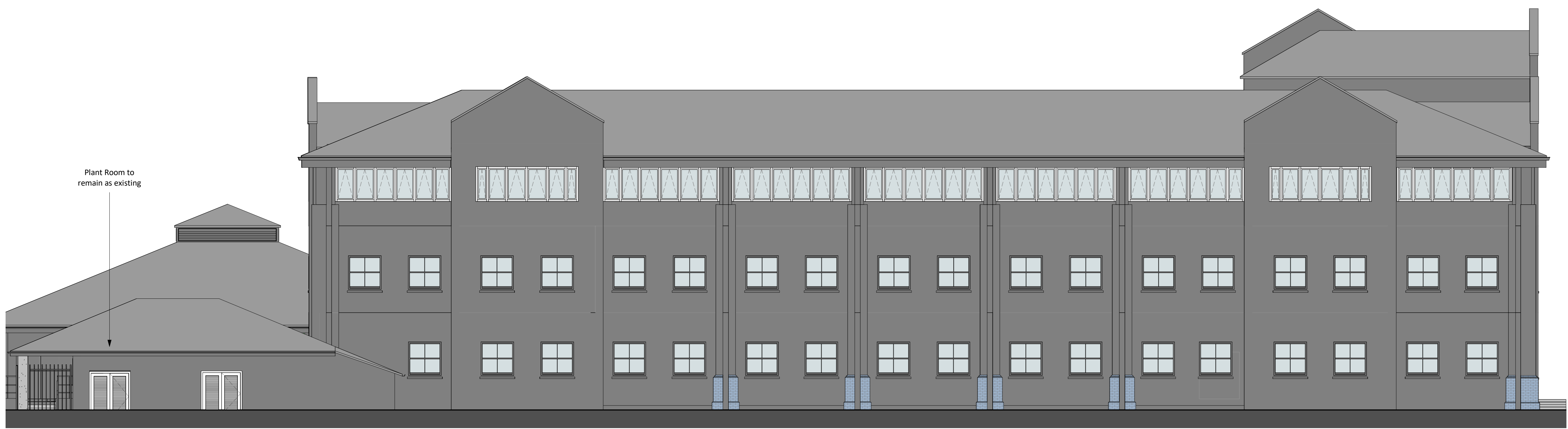
5 Existing Elevation 1 Scale:- 1 : 100