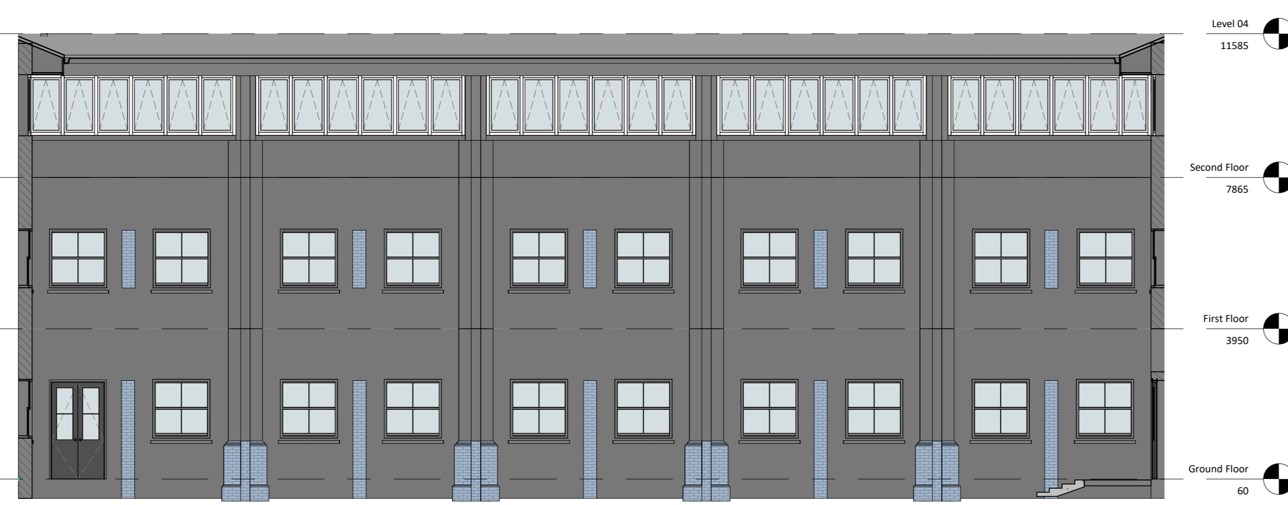
2 Existing Courtyard Elevation 2 Scale:- 1 : 100