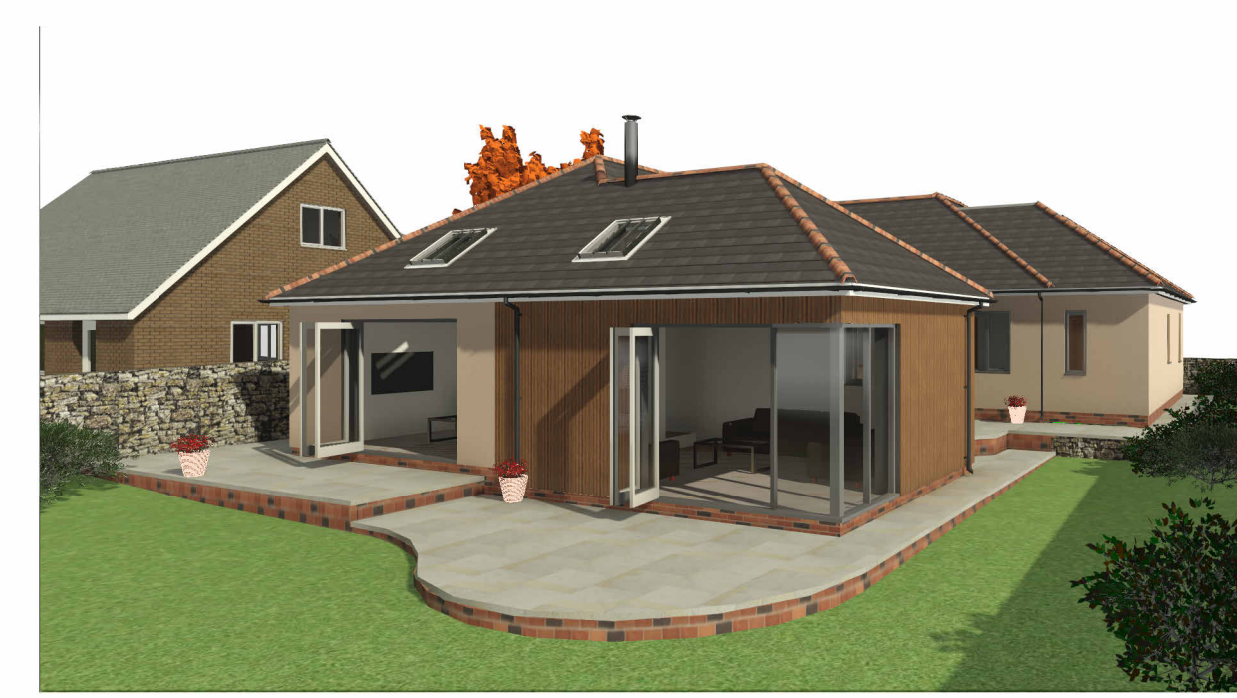
3D Proposed Rear View