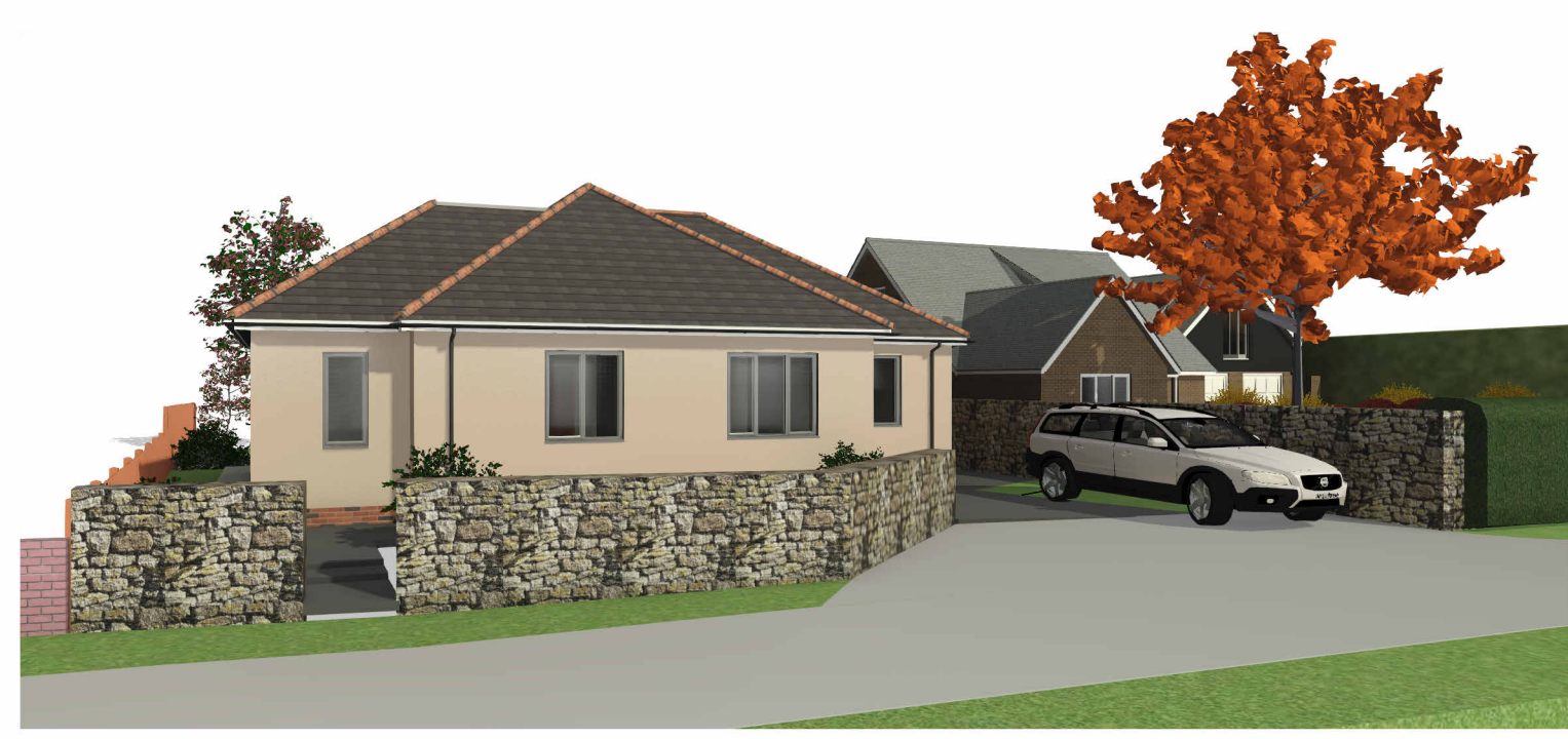
3D Proposed Front View