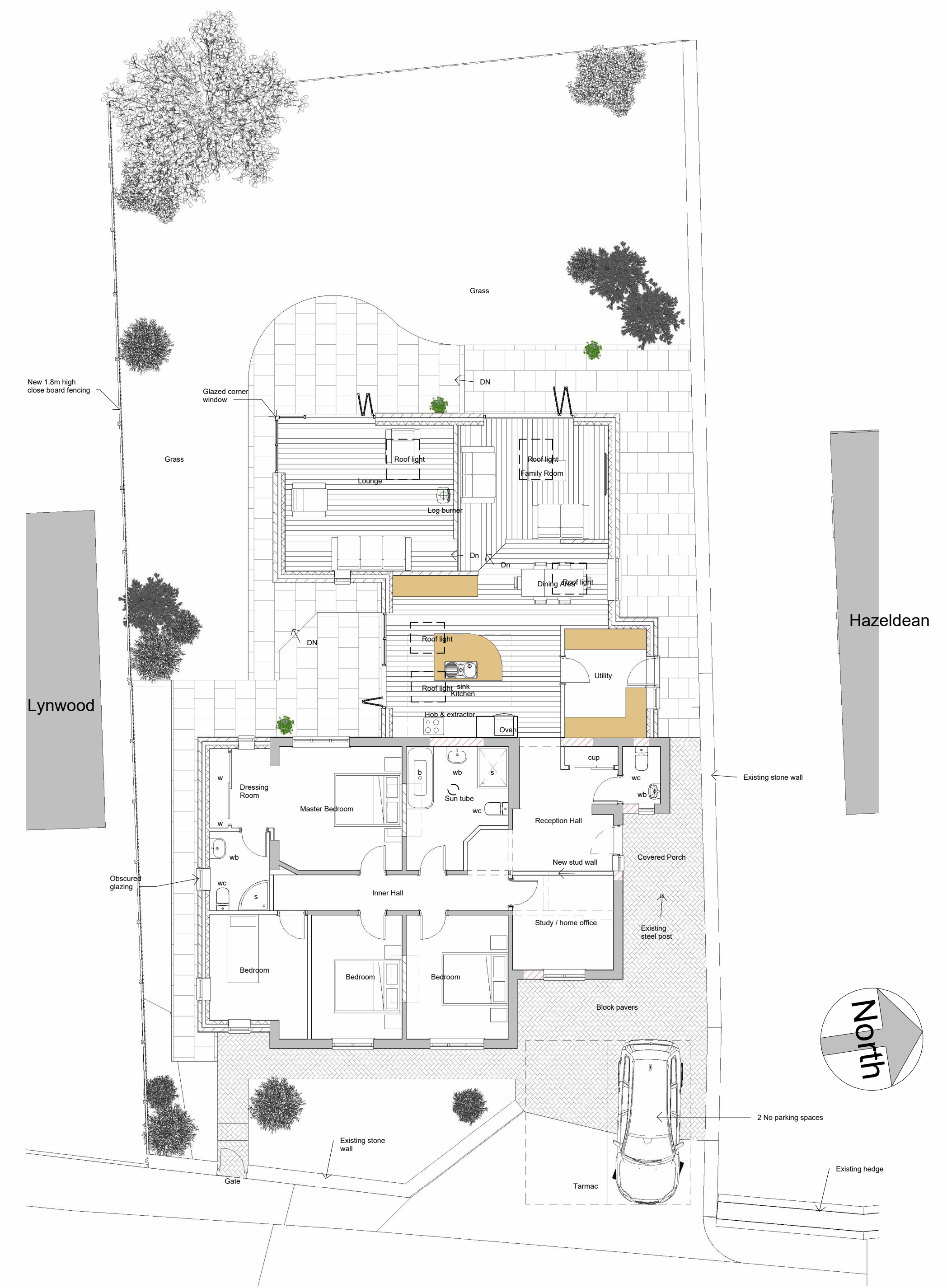
Ground Floor Plan. 1 : 100