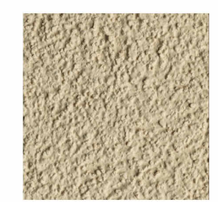
New smooth render and colour finish 'K' REND (Mocha)