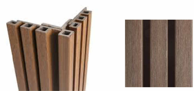
Ecoscape composite cladding spiced oak