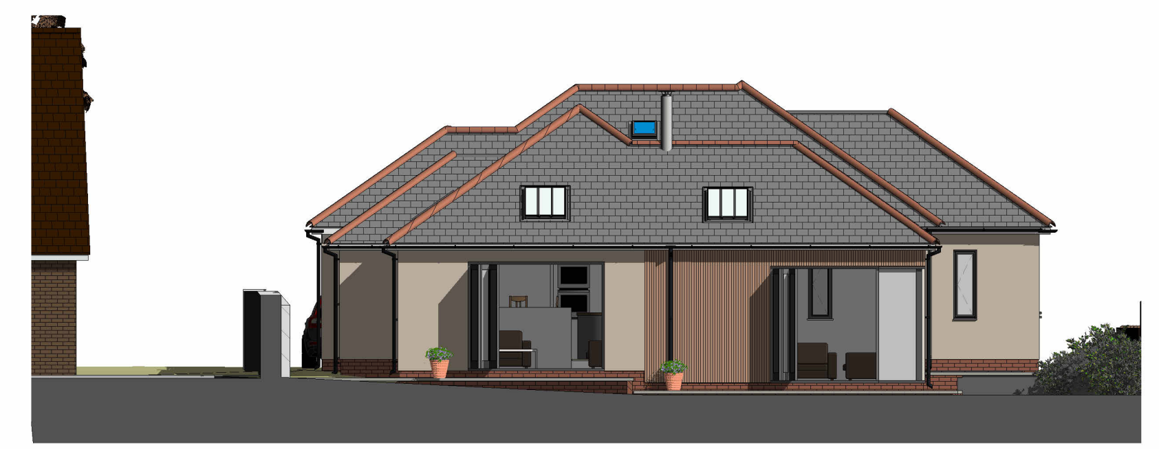
West Elevation 1 : 100