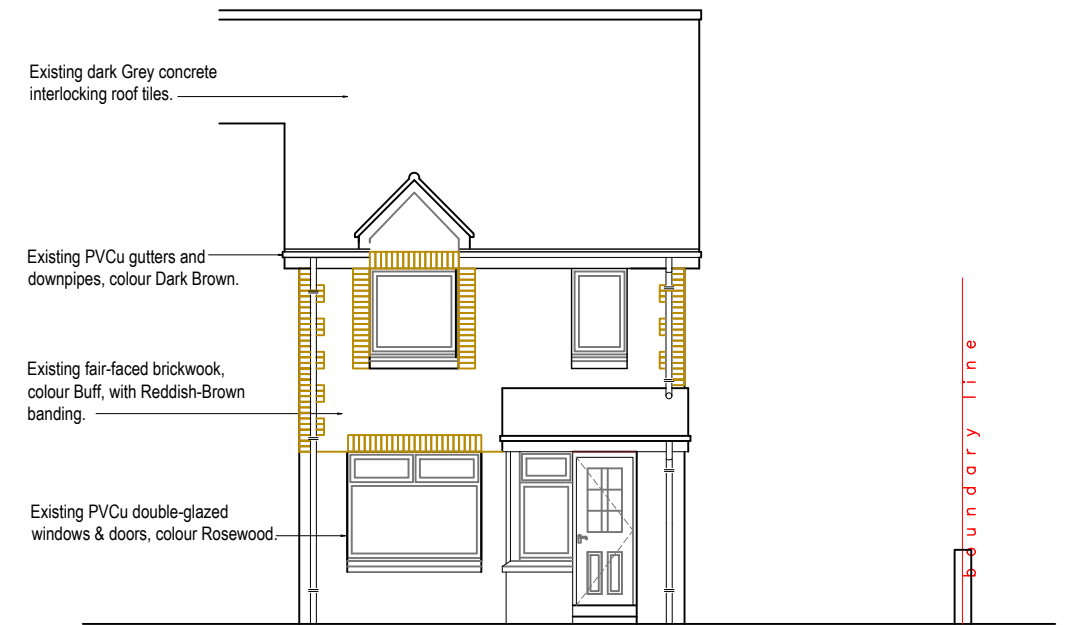
Existing South-West Elevation Scale 1:100