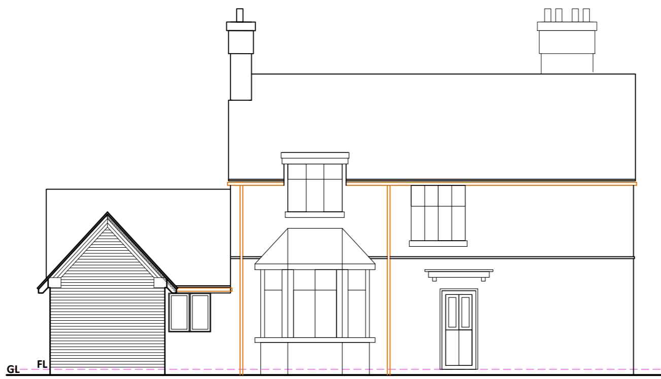
SIDE ELEV. 1:100