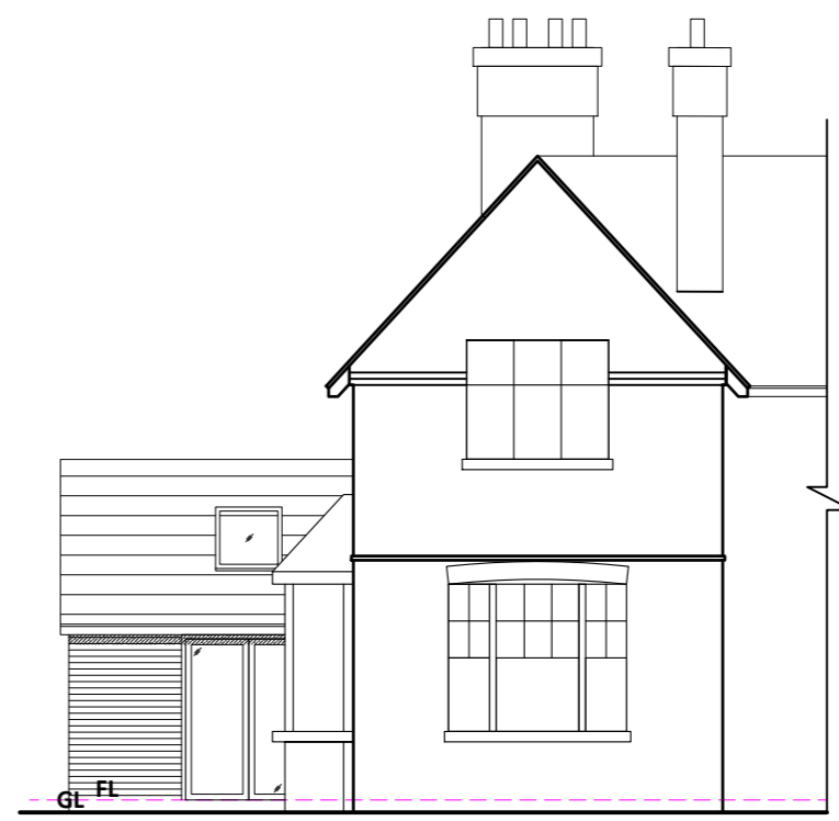
FRONT ELEV. 1:100

DISCLAIMER All initial sketches and drawings produced for planning applications are design/conceptual drawings only. They must not be used as the basis of any construction or building work. They remain the property of and subject to the copyright of the author.