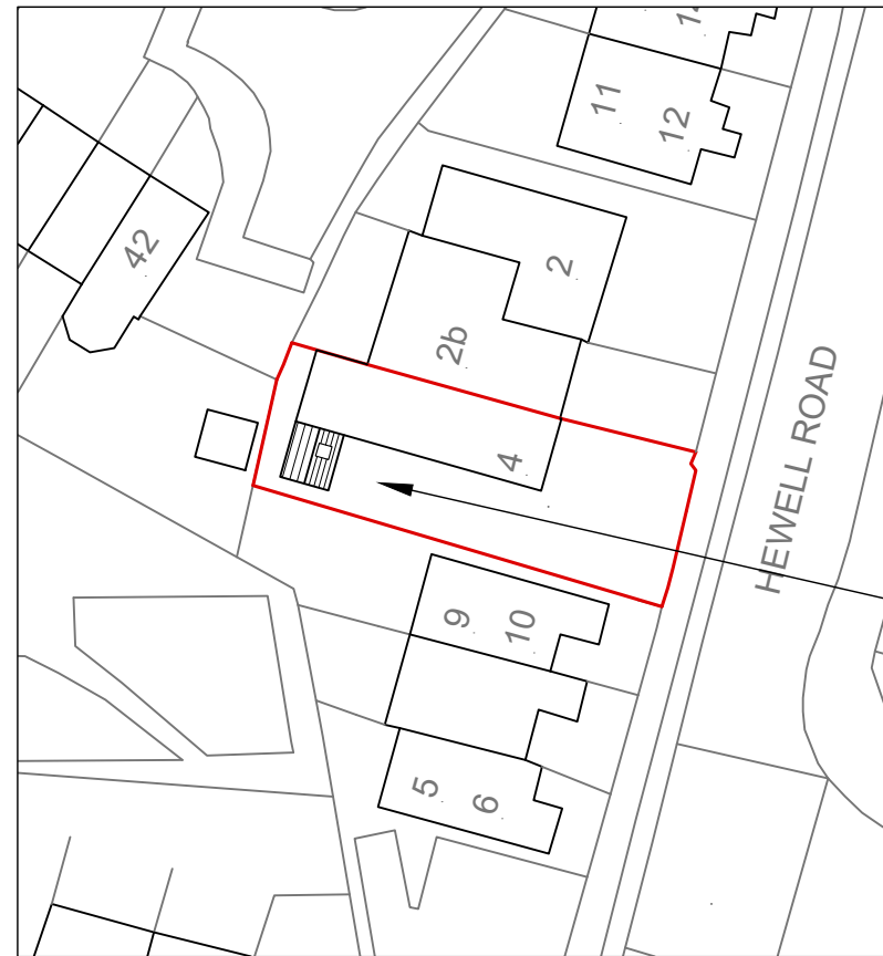
PROPOSED SITE PLAN 1:500